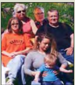
Kelly family and descendants