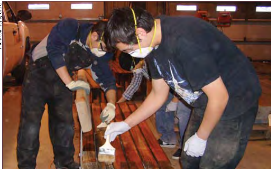
A component of the YouthBuild program is 40 hours of volunteer service. Here, enrollees work on completing a bench for the Municipality of Anchorage.

Five-month program can transform lives of youth