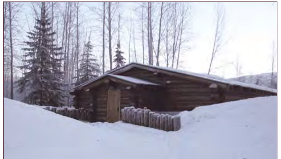
The Alaska Native Heritage Center's new Athabascan Ceremonial house offers gathering space available for rent.

Building is final village site revitalization project