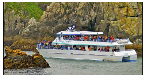
CATC is the parent business of Kenai Fjords Tours, a leading Alaska marine day-cruise company.

Are you looking to explore Talkeetna, dine on gourmet cuisine and wake up to awe-inspiring views of Denali and the Alaska Range? CATC is offering 50 percent off a second-night stay at the Talkeetna Alaskan Lodge. CATC is also offering packages for fly-in and hike Denali; a two-night, one-cruise deal for the Seward Windsong Lodge and Kenai Fjords National Park Tour; a special for viewing migrating California gray whales with one night of accommodations at the Hotel Seward and admission to Seward's famous SeaLife Center and packages for peaceful rest and gourmet meals on Fox Island with either Northwestern Fjord Tour or kayaking adventures.