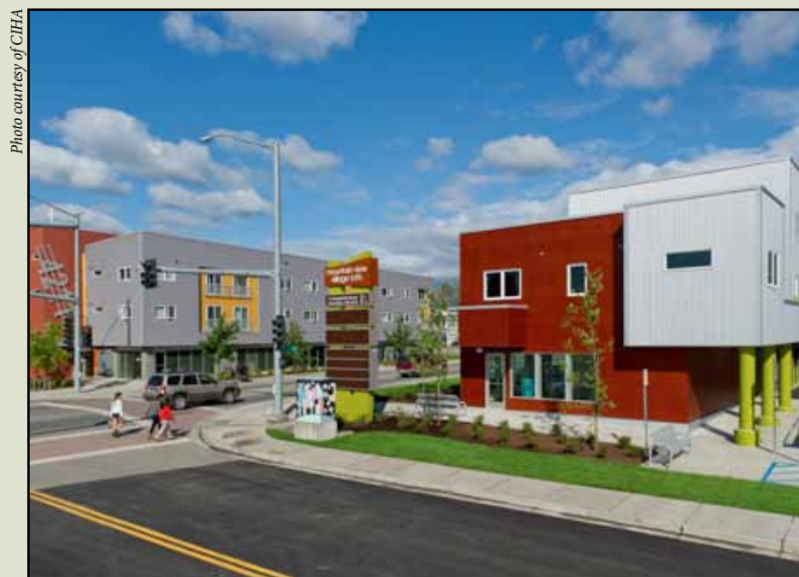
CIHA's Mountain View Village homes offer quality workmanship, award-winning design and energy efficient features and appliances.

Cook Inlet Housing Authority (CIHA) accepted a Pacific Northwest Regional Council Award for Innovative Service for its Mountain View Village project, CIHA's variety of affordable rental properties located throughout Mountain View. The award, accepted on April 29, recognizes CIHA's contributions to the Mountain View neighborhood.