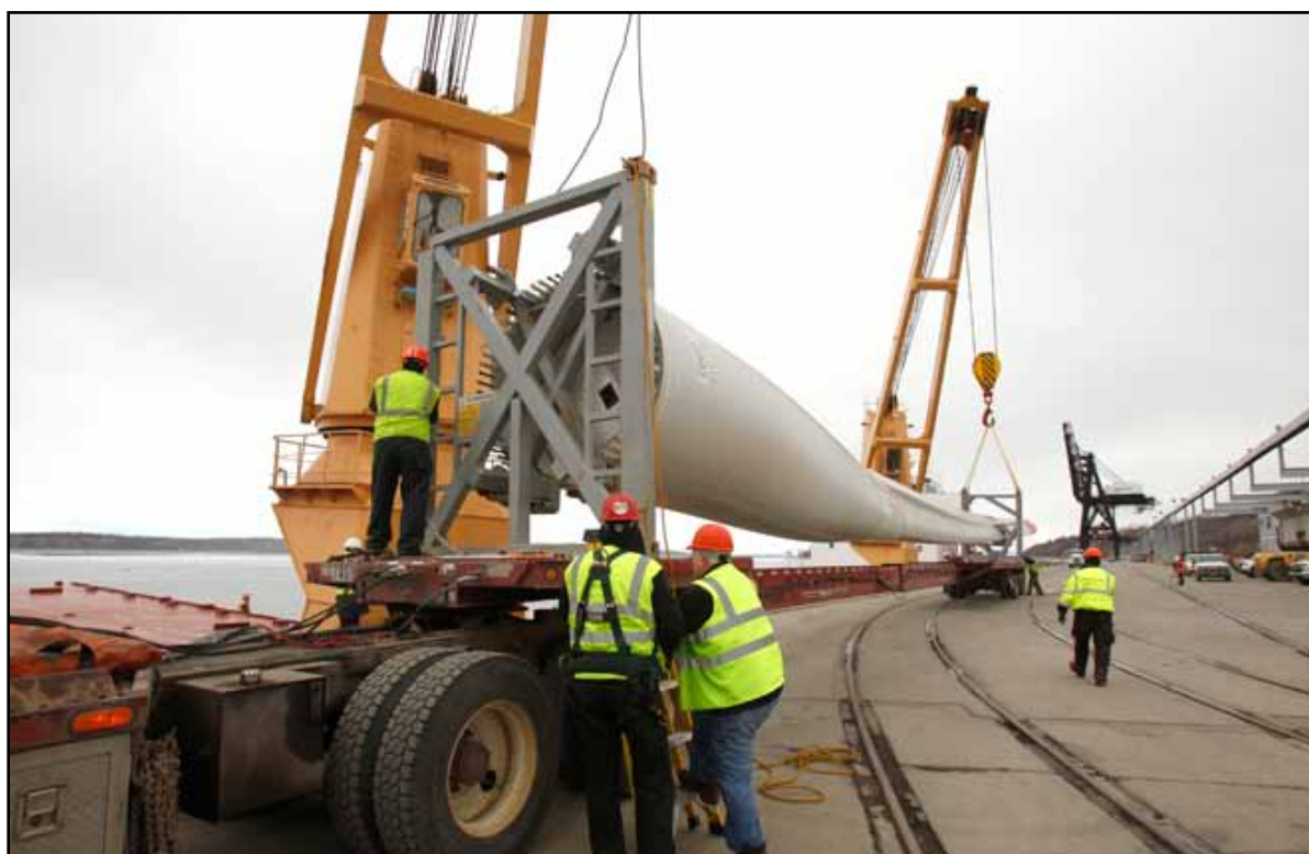
A wind turbine blade is off-loaded from the vessel that transported it to the Port of Anchorage. Fire Island wind turbines will stand 80 meters tall, and blades are 40 meters long. Rotation speed will vary between 9.9 and 18.7 rotations per minute.

Mobilization of construction equipment and work crews to Fire Island began in early April, and is ongoing. Road construction and construction of the overhead