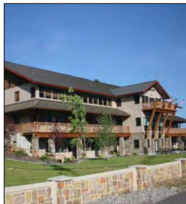
The North Wind Group is a business leader in the environmental, engineering and construction service industries.