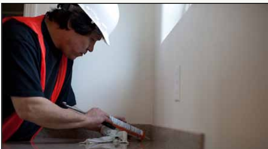
Cook Inlet Housing Authority's (CIHA) Loussac Place is now accepting applications for townhouse-style rental homes. Call (907) 793-3000 or visit www.cookinlethousing.org to learn more about CIHA's programs and rental properties.

In early May, Cook Inlet Housing Authority (CIHA) was notified that it received a Rasmuson Foundation Tier 1 Grant of up to $25,000 to be used for capital projects, technology updates, capacity building, program expansion and creative works. The grant will be used to purchase library and computer room equipment for resident use at the Z.J. Loussac Community Building at Loussac Place. CIHA is thankful for the support of and partnership with the Rasmuson Foundation.