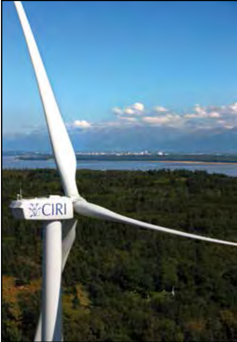
CIRI's logo appears on one of the 11 completed turbines.