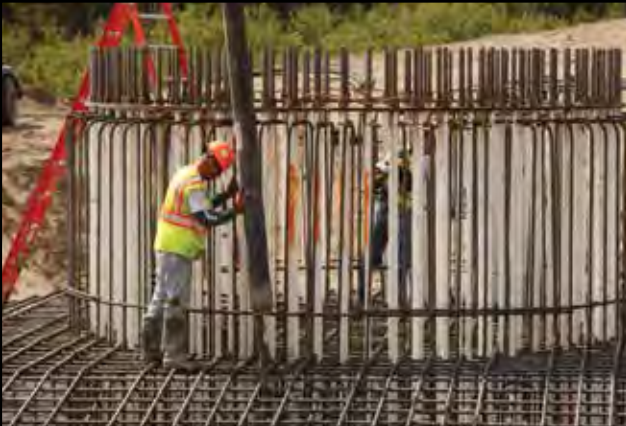
Workers construct the turbine foundations with steel reinforced concrete to support over 162 tons of weight that each fully assembled turbine is estimated to weight.