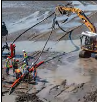
Workers installed submarine transmission cables across Turnagain Arm to the north of Point Campbell.