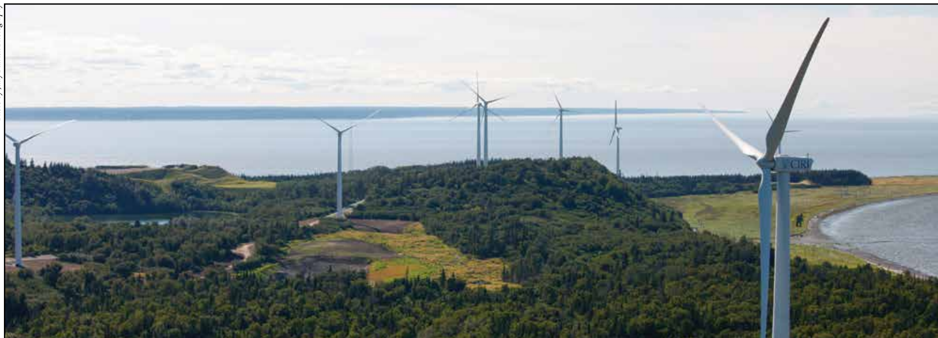
The Fire Island Wind project's first phase includes 11 turbines. All turbines are complete and are expected to be commissioned by late September.