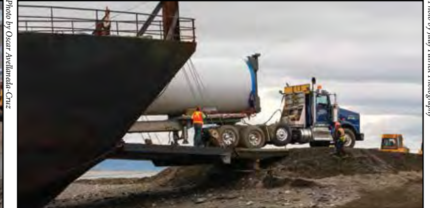
Workers adjust a dirt dock according to the tide table for each barge delivery of turbine parts to Fire Island.