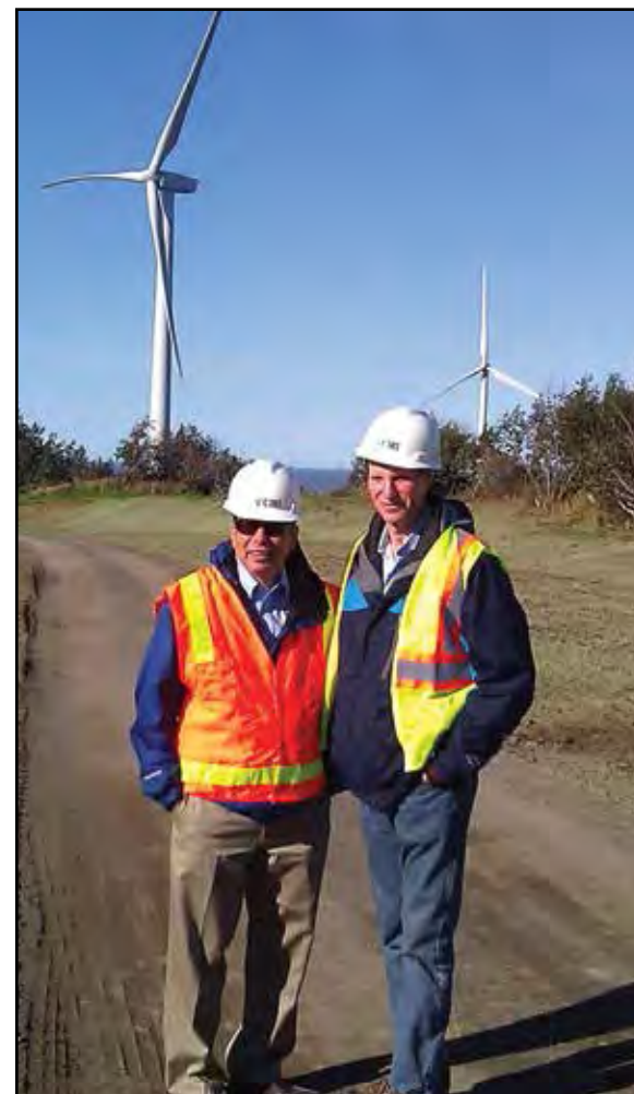
Senator Begich and Senator Wyden (D. Oregon) touring the Fire Island Wind farm.

Learn more at www.fireislandwind.com and www.ciri.com .