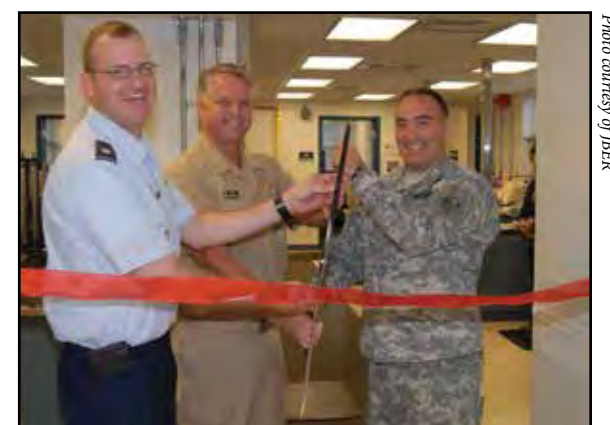
Defense Logistics Agency fuels laboratory ribbon cutting at Joint Base Elmendorf Richardson.

Weldin Construction Services is a CIRI Services Corp. company that provides construction and construction management services primarily for local, state and federal governments. To learn more, visit www.weldin.com .