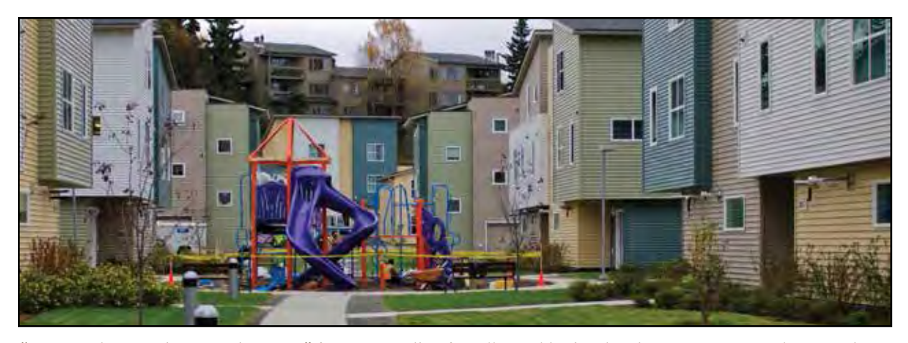
"Loussac Place... Where Families Grow" features a walker-friendly neighborhood with green space, two playgrounds and a tenant garden area. The Z.J. Loussac Community Building will offer Camp Fire USA after-school programs complete with an onsite community director, a computer lab, a library, reading space and space for community events.

Loussac Place offers a variety of housing sizes from one- to four-bedroom units, including nine fully accessible apartments. As of the grand opening date, CIHA had received 578 applications, nearly five applicants for every apartment. Ninety applications have been approved, and 63 families have moved into their new homes. Construction on the final buildings of Loussac Place will be completed in early December and all of the new residents will be moved into their new homes by Christmas. Learn more about Loussac Place and CIHA by visiting www.cookinlethousing.org.