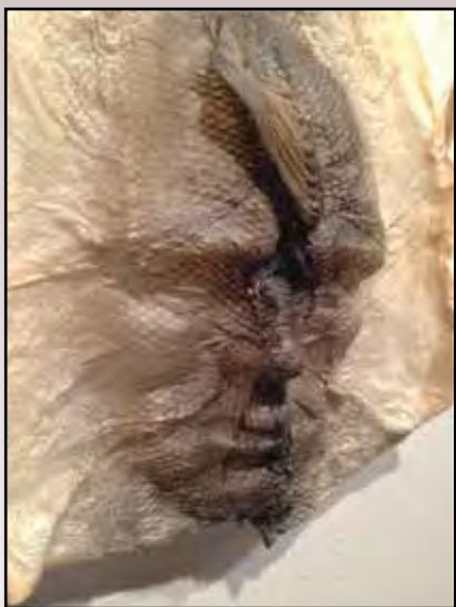
Hanging salmon skin art with facial impression.