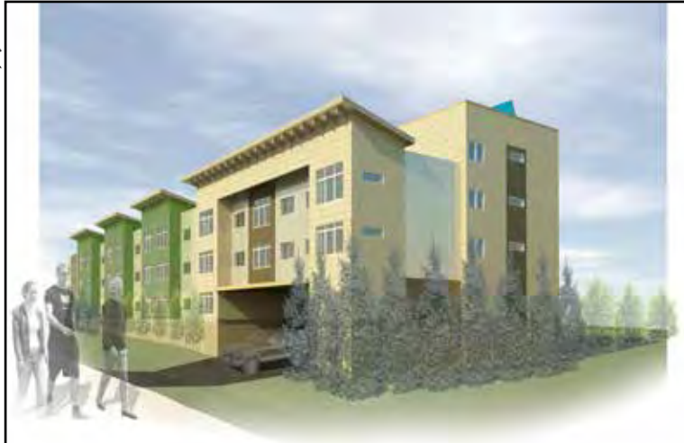
Rendering of CIHA's Coronado Park Senior Villa planned for Eagle River.