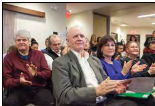
Village corporation leaders at the March 1 conveyance signing ceremony.

Alaska at the time ANCSA was passed, some village corporations were unable to select land with geographic ties to their traditional villages. This resulted in lands, referred to as 12(b), that could be selected from other areas within the Cook Inlet region. These lands were held by CIRI for the village corporations’ benefit until they agreed on a process to make land selections. Due to the prior lack of agreement, the selection process was delayed for decades. The delays prevented the village corporations from managing the lands and receiving economic benefits.