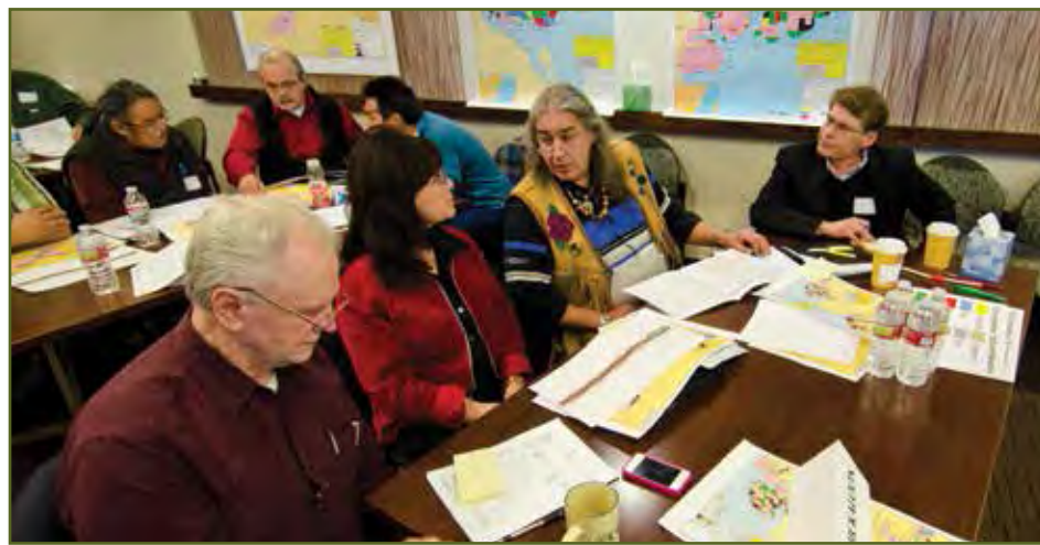
Members of Chickaloon Moose Creek Native Association at the Feb. 1, 12(b) land selection meeting.

The amount of acreage each village was allowed to select depended on how much a village was able to select in its original entitlements. For example, Chickaloon and