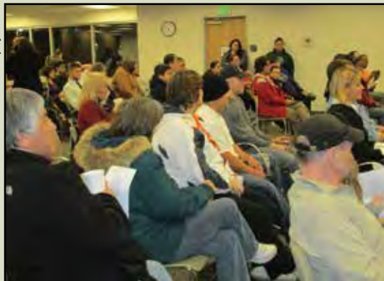
November 2012 Adult Reentry Program graduation ceremony attendees.

The Alaska Native Justice Center (ANJC), a CIRI-founded nonprofit, developed the Adult Prisoner Reentry Program to promote the effective reintegration of offenders to communities upon release from prison and jail.