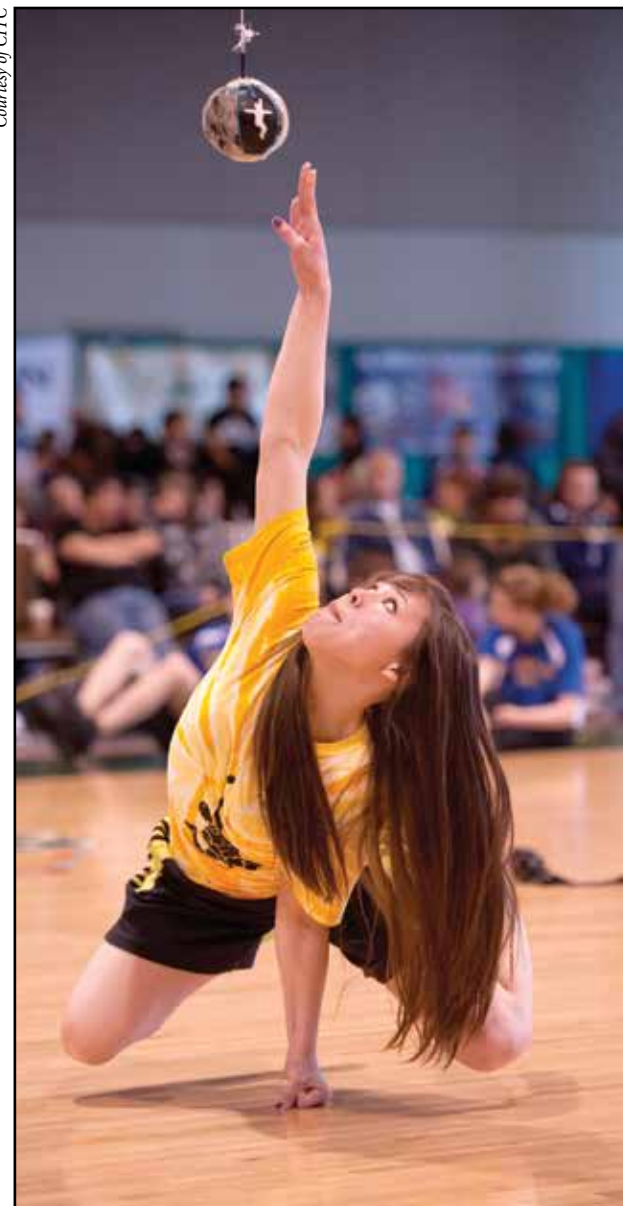
NYO athlete participating in the One-Hand Reach contest.