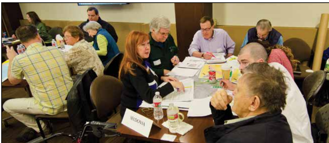
Representatives from Salamatof Native Association, Inc. (left table) and Seldovia Native Association, Inc. (right table) at the 12(b) selection meeting Feb. 1.