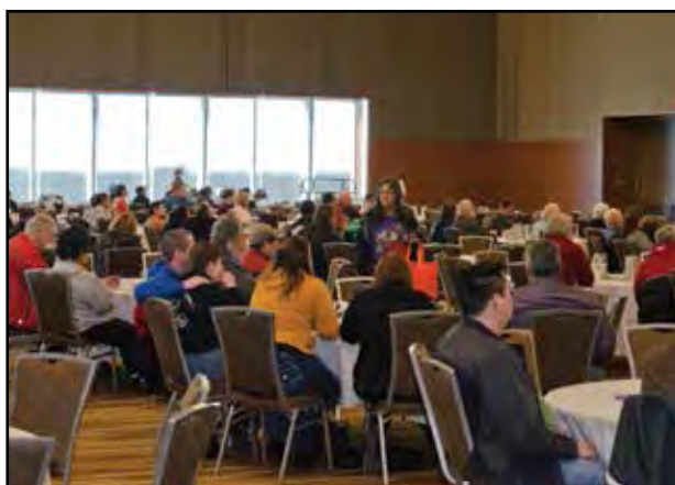
CIRI shareholders and their immediate family members listening to the CIRI presentation April 2013.