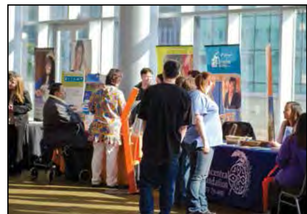
CIRI shareholders and their immediate family members visiting the CIRI nonprofit booths and shareholder artist tables at the Anchorage meeting.