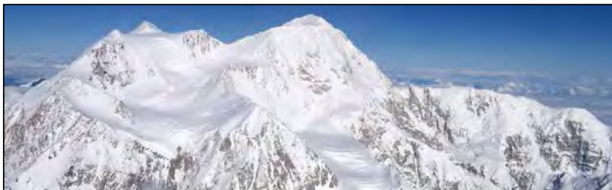
Denali, also known as Mount McKinley, is the tallest mountain in North America with a summit elevation of 20,320 feet (6,194 m) above sea level.

Mission is to inspire Alaska Native youth