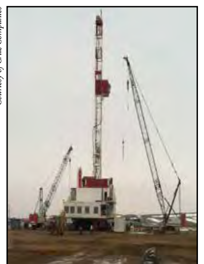
Cruz Energy Services erects Sidewinder 105 after hauling it 1,600 miles from Houston, Texas.