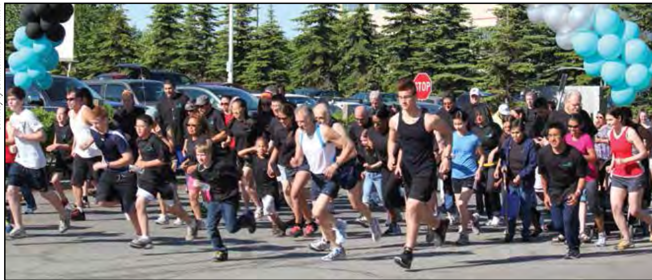
Start of the 2012 SCF Fun Run and Family Wellness Festival.

CIRI's nonprofit health care affiliate, Southcentral Foundation, is hosting its 7th Annual Fun Run/Walk and Family Wellness Festival on Saturday, May 18. This free community event encourages Alaska Native and American Indian people to get moving, get healthy and get fit.