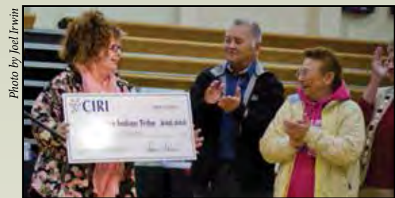
Members of KIT accepting CIRI's donation at the Kenai shareholder meeting.

Will benefit the Dena'ina Wellness Center