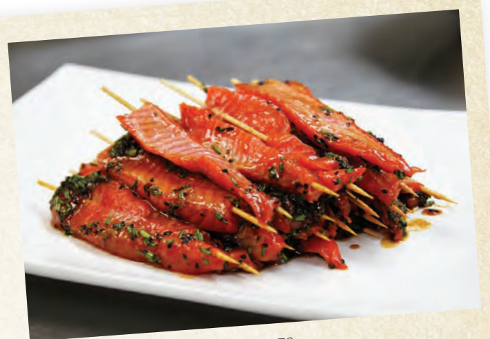
» Salmon Belly Skewers.

2 lbs. Alaska salmon belly pieces, skin removed, cut into cubes or leave in long sections. If salmon belly is in short supply, cubed salmon filet may also be used. 1/8 cup shoyu sauce 1/8 cup mirin 1/4 cup honey 3 tablespoons spicy black bean paste 1 tablespoons sesame oil 1 teaspoons smoked paprika 1 teaspoons cayenne 1 1/2 tablespoons toasted black sesame seeds 3/4 cup of diced chives 6 sprigs beach greens