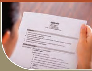
Job fair & resume workshop