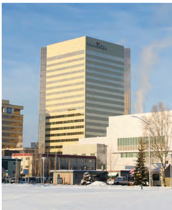
▶ Downtown Anchorage, ConocoPhillips Alaska building.