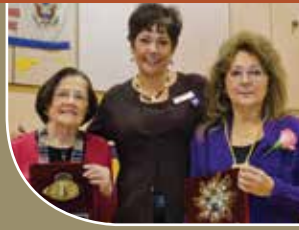
CIRI seeks 2014 Award Nominations