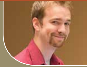
Internships boost career prospects for shareholders