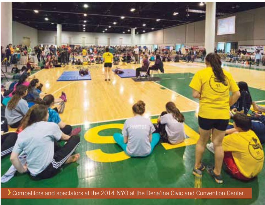
› Competitors and spectators at the 2014 NYO at the Dena'ina Civic and Convention Center.