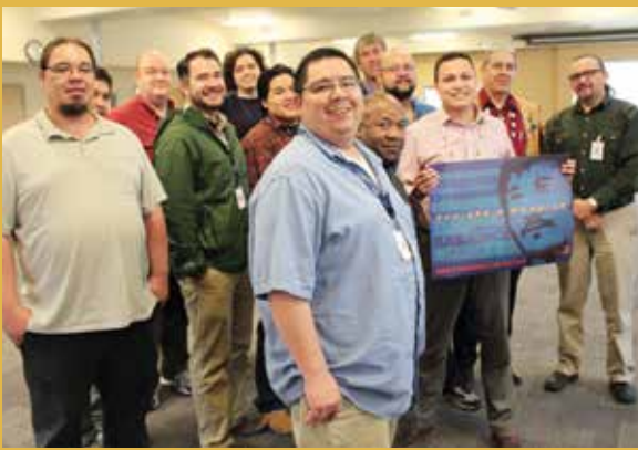
› SCF is hosting a series of free activities at the Anchorage Native Primary Care Center in observance of Men's Health Week.

SCF Health Education Department (907) 729-2689 or visit www.southcentralfoundation.org