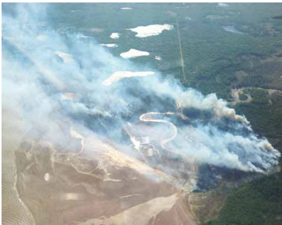
Aerial view of the wildfire in Tyonek, Alaska, on May 19 that had grown to a footprint of more than 1800 acres by May 22.

Please be advised that due to extreme fire hazard, all CIRI lands are closed to recreational use permits until further notice. In the interest of public safety, CIRI lands will not be available for recreational use until the danger has passed. Please check the CIRI website at www.ciri.com for further updates as they are available.