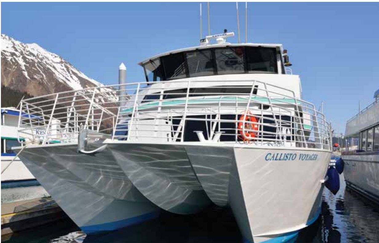
› The M/V Callisto Voyager in Seward, Alaska.

Kenai Fjords Tours' (KFT) new state-of-the-art catamaran, the M/V Callisto Voyager, is officially on the water. The vessel was launched in Washington, where it went through a series of standard tests before the journey to Seward, Alaska.