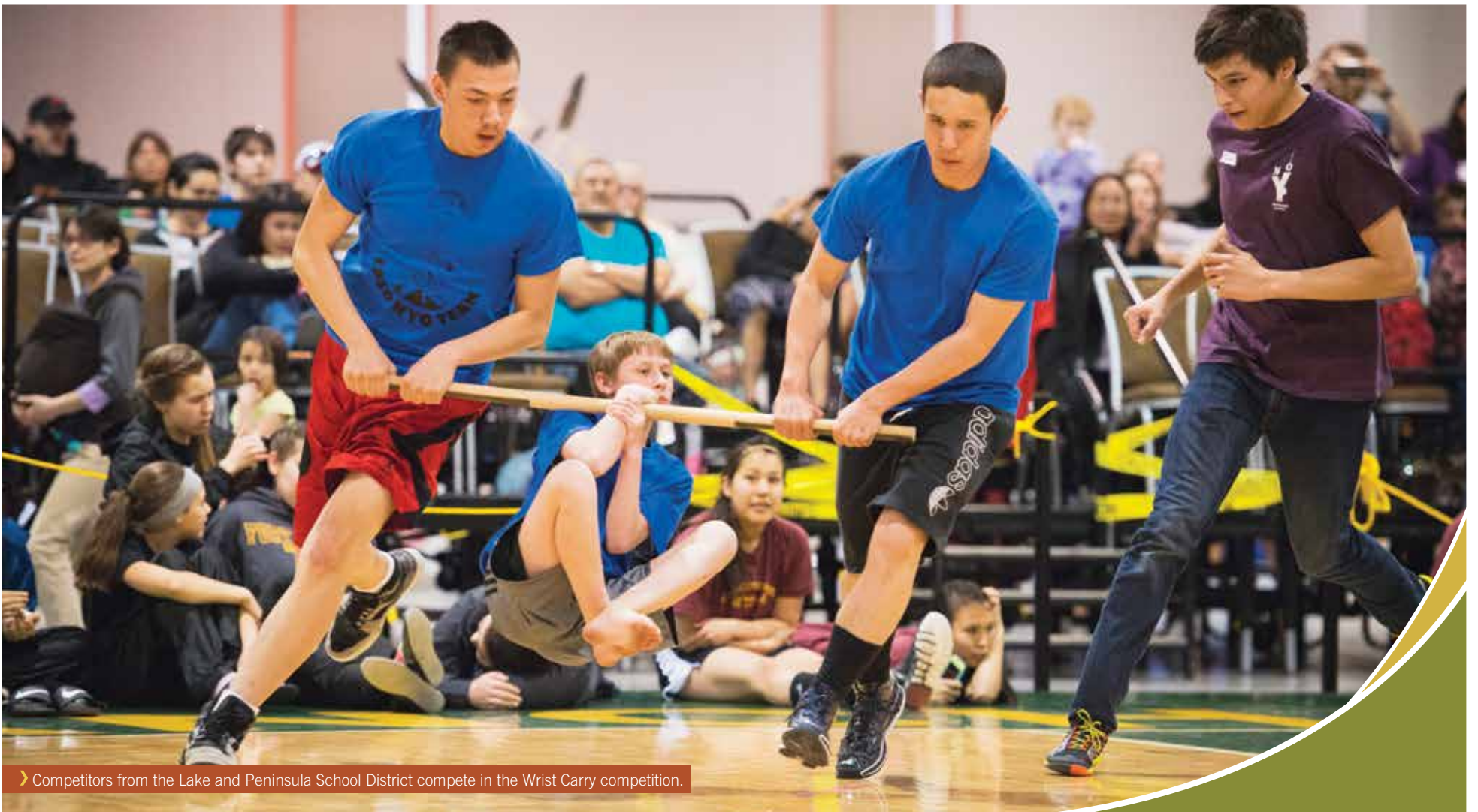
› Competitors from the Lake and Peninsula School District compete in the Wrist Carry competition.