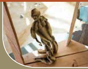
Wellness Center artwork provides healing | 03