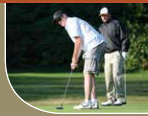
Local nonprofits score with CIRI Golf Classic | 04