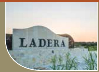
Ladera community breaks ground | 07