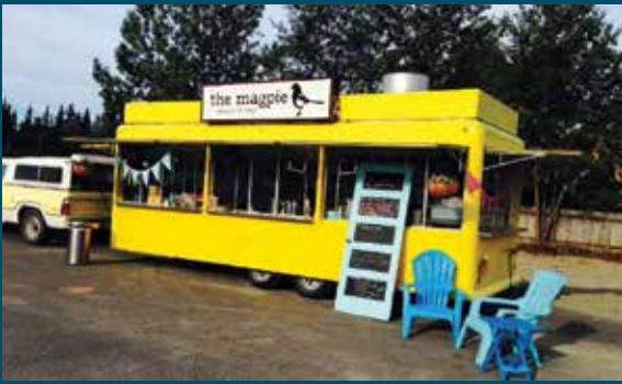
▶ The Magpie food truck makes appearances throughout Anchorage all summer long.

When not helping out on the truck, Two Elk can often be found studying and watching the couple's kids.