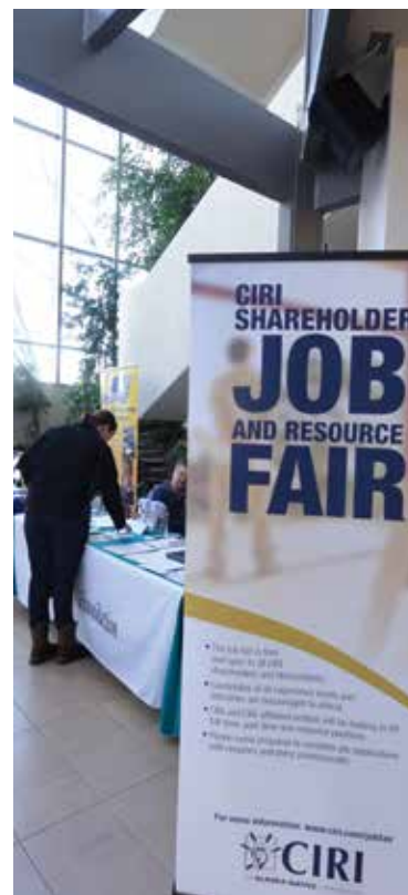
Left: The 2015 CIRI summer interns participated in a number of activities, including a casual lunch with CIRI Board members. Right: CIRI's annual Job Resource Fair offers shareholders and descendants opportunities to apply for jobs with a number of employers, including other Alaska Native corporations.