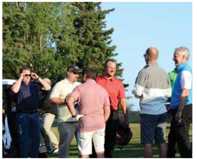
▶ 2015 CIRI Golf Classic.