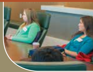
Take the next generation to work | 04