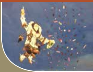
Alaska Native Art Auction | 02