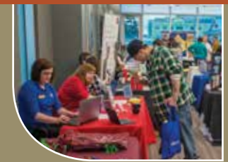
CIRI Job and Resource Fair | 04