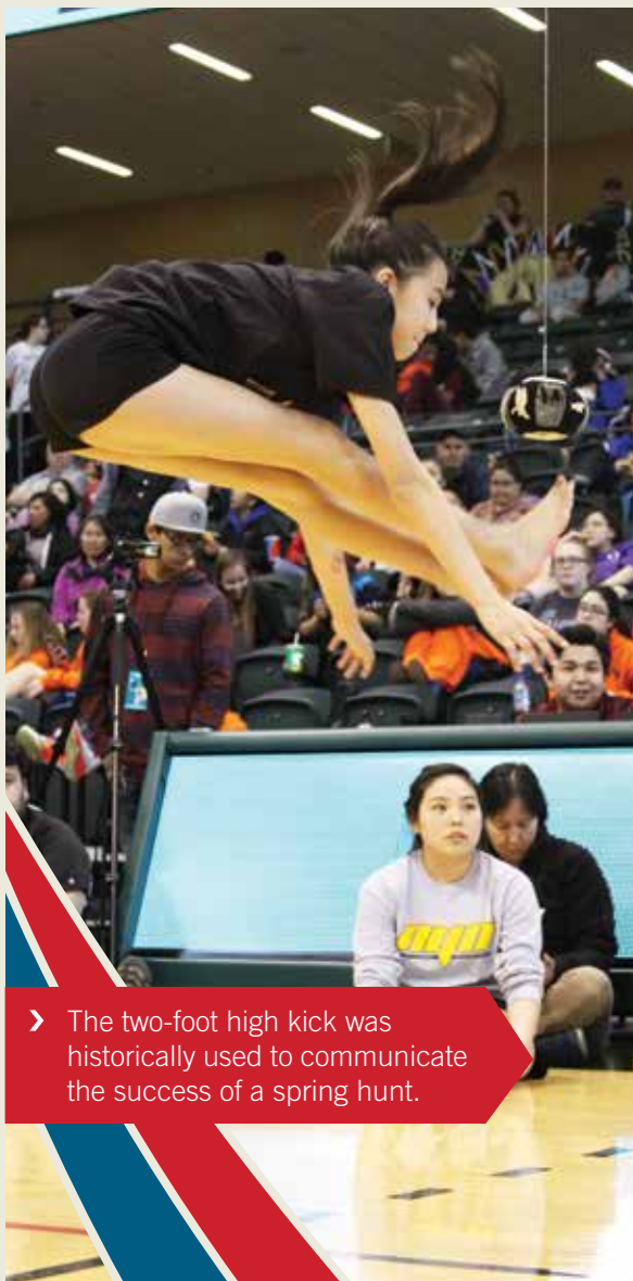
The two-foot high kick was historically used to communicate the success of a spring hunt.