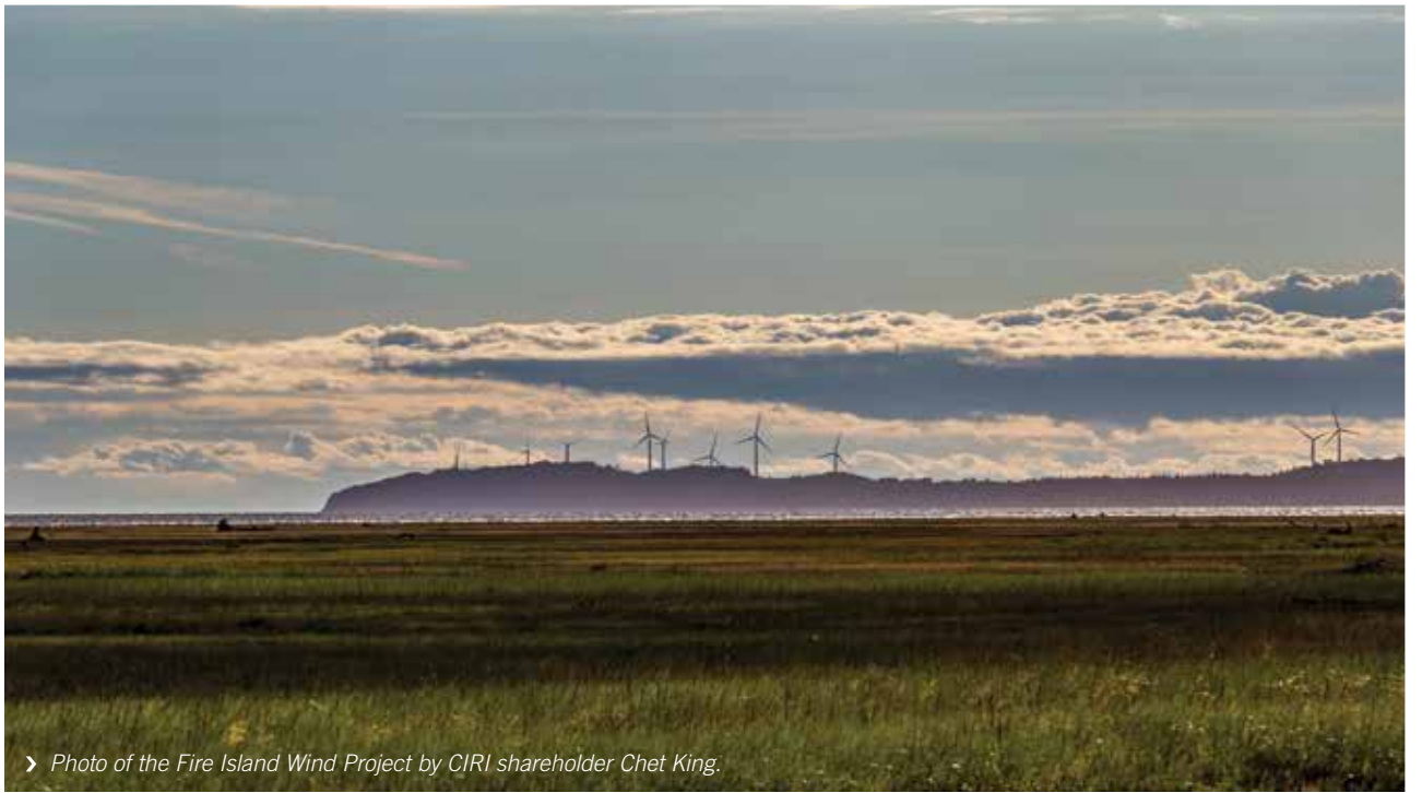
> Photo of the Fire Island Wind Project by CIRI shareholder Chet King.

CIRI original shareholders and their direct lineal descendants may complete their scholarship and grant applications online at www.thecirifoundation.org . Applicants must have an approved online user account to apply. For more information, please contact TCF by phone at (907) 793-3575 / (800) 764-3382 or e-mail at TCF@thecirifoundation.org .