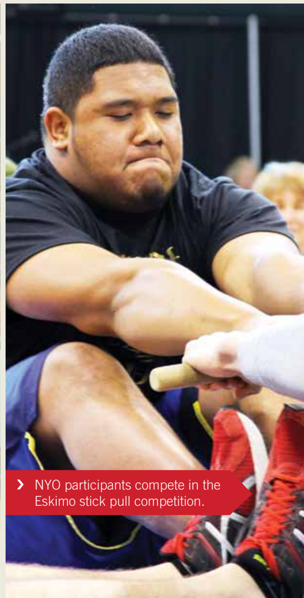
NYO participants compete in the Eskimo stick pull competition.