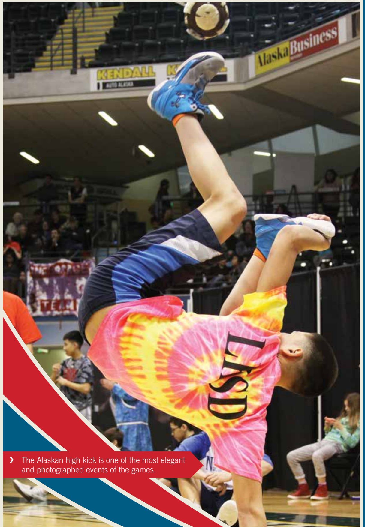
› The Alaskan high kick is one of the most elegant and photographed events of the games.