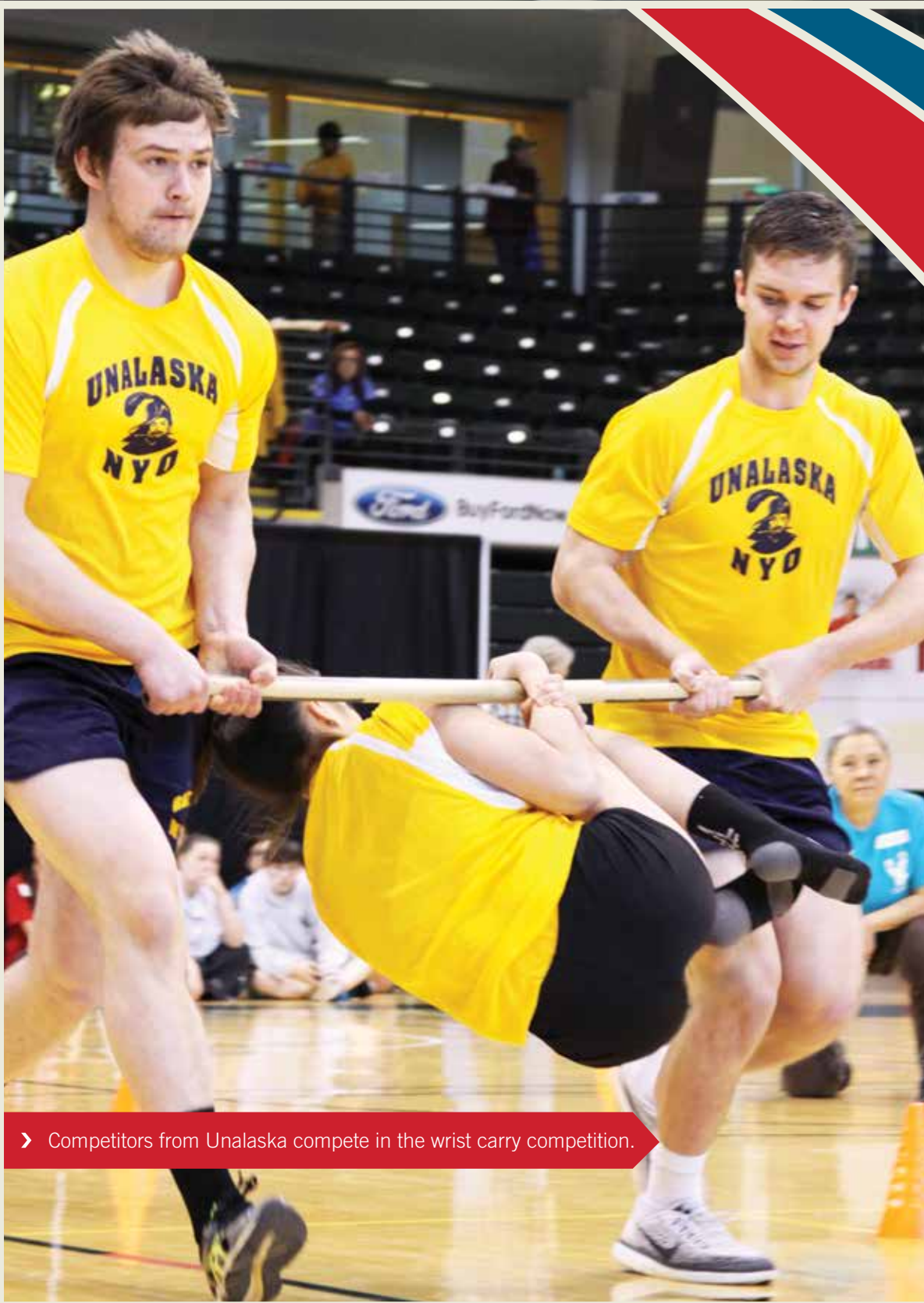
Competitors from Unalaska compete in the wrist carry competition.