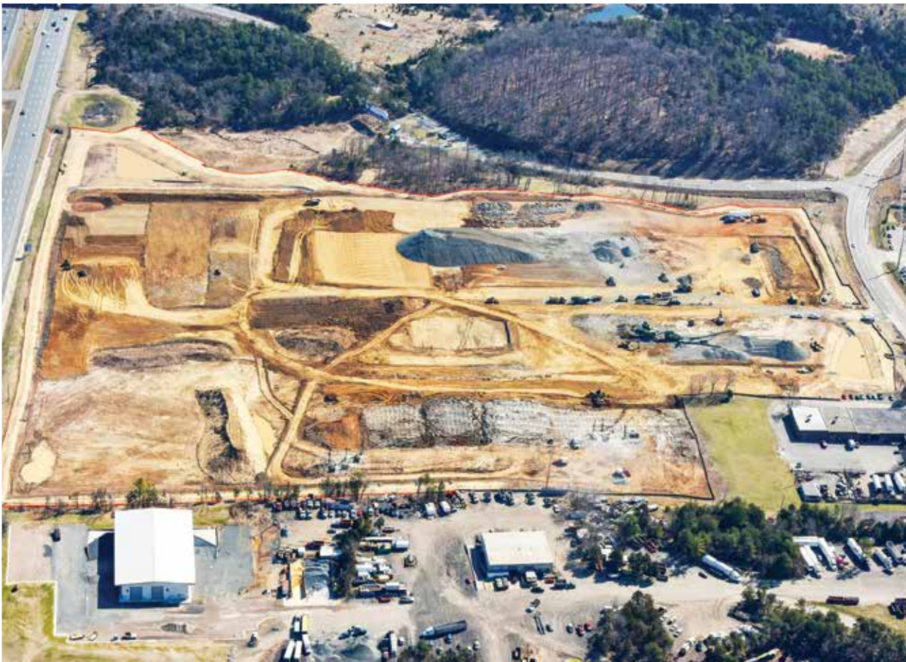
➤ A 50-acre plot of land in Manassas, Va., will eventually become the Merritt I-66 Business Park, a six-building light-industrial/bulk warehouse development.