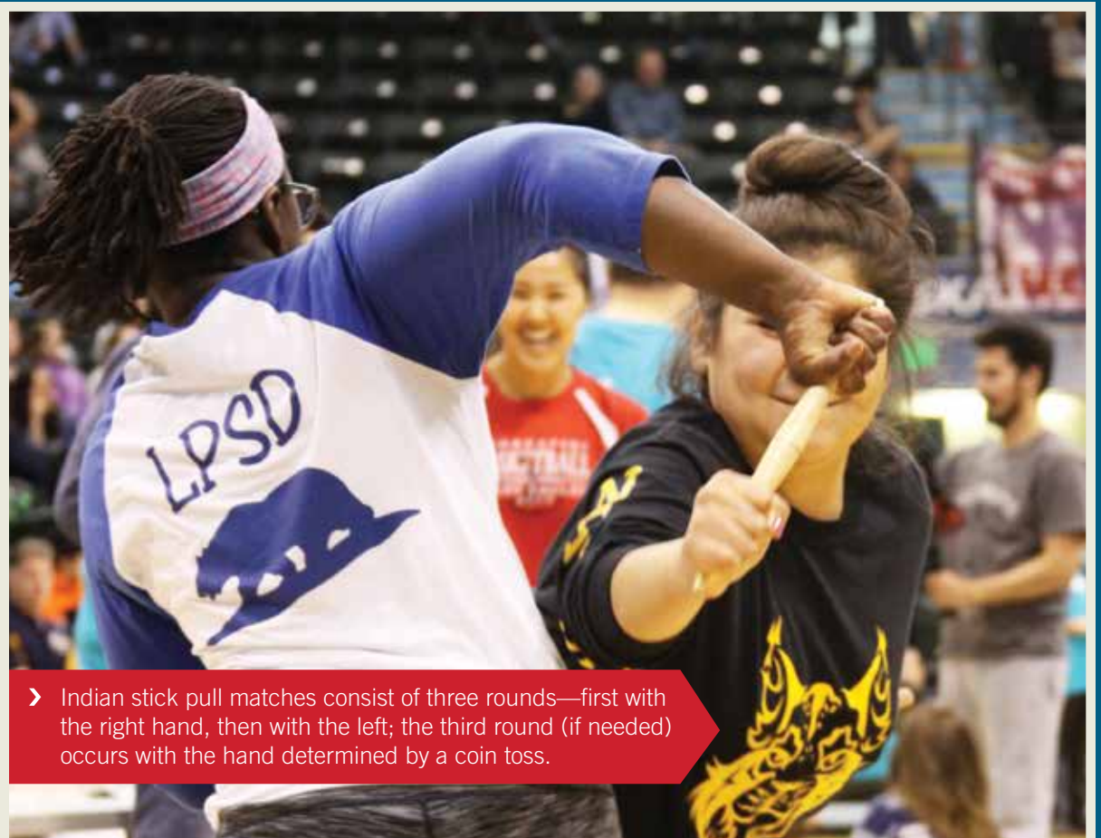
› Indian stick pull matches consist of three rounds—first with the right hand, then with the left; the third round (if needed) occurs with the hand determined by a coin toss.