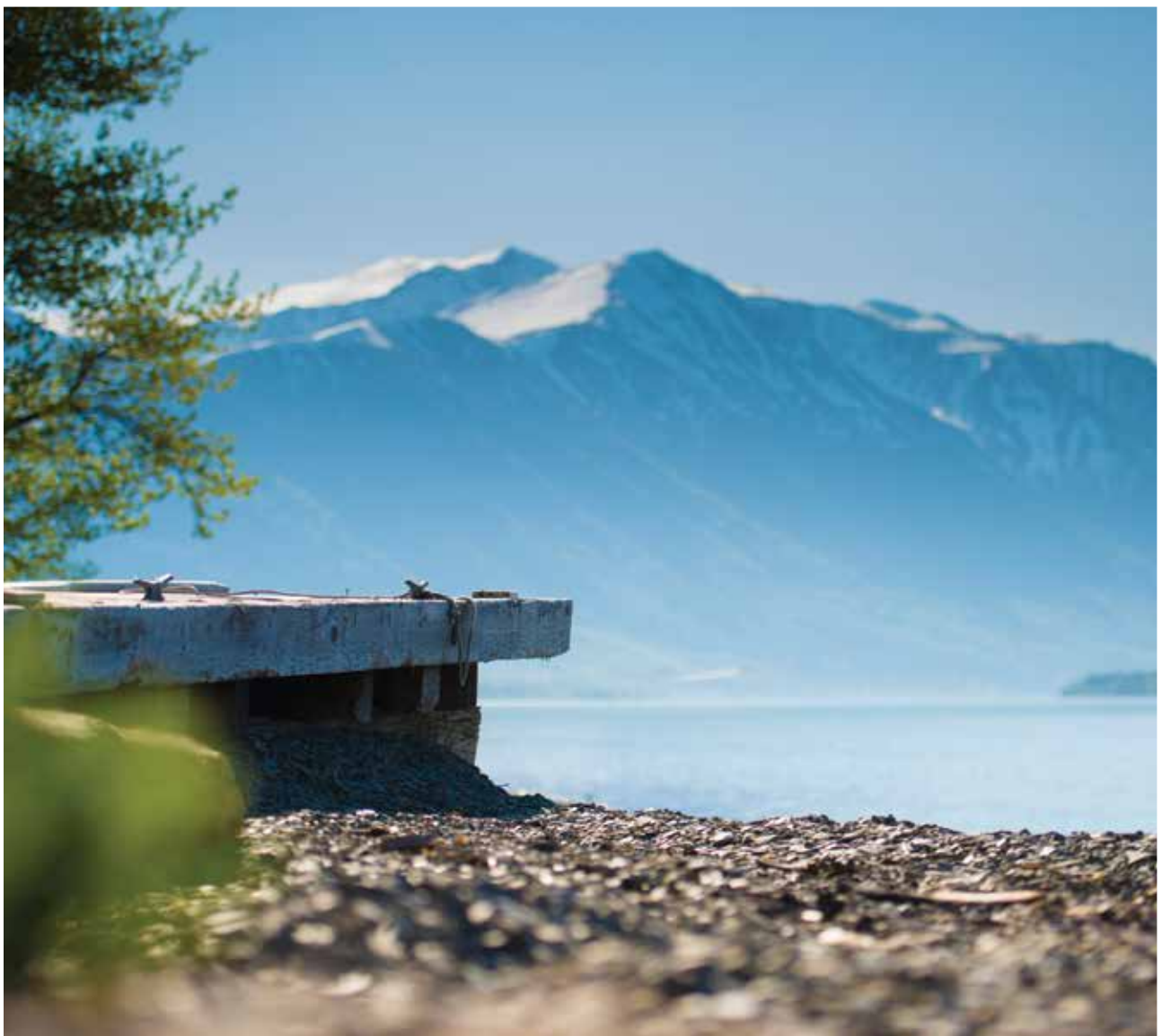
SETTLEMENT TRUST, CONTINUED FROM PAGE 01