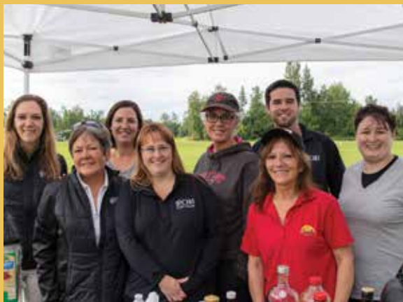
› A group of CIRI volunteers.