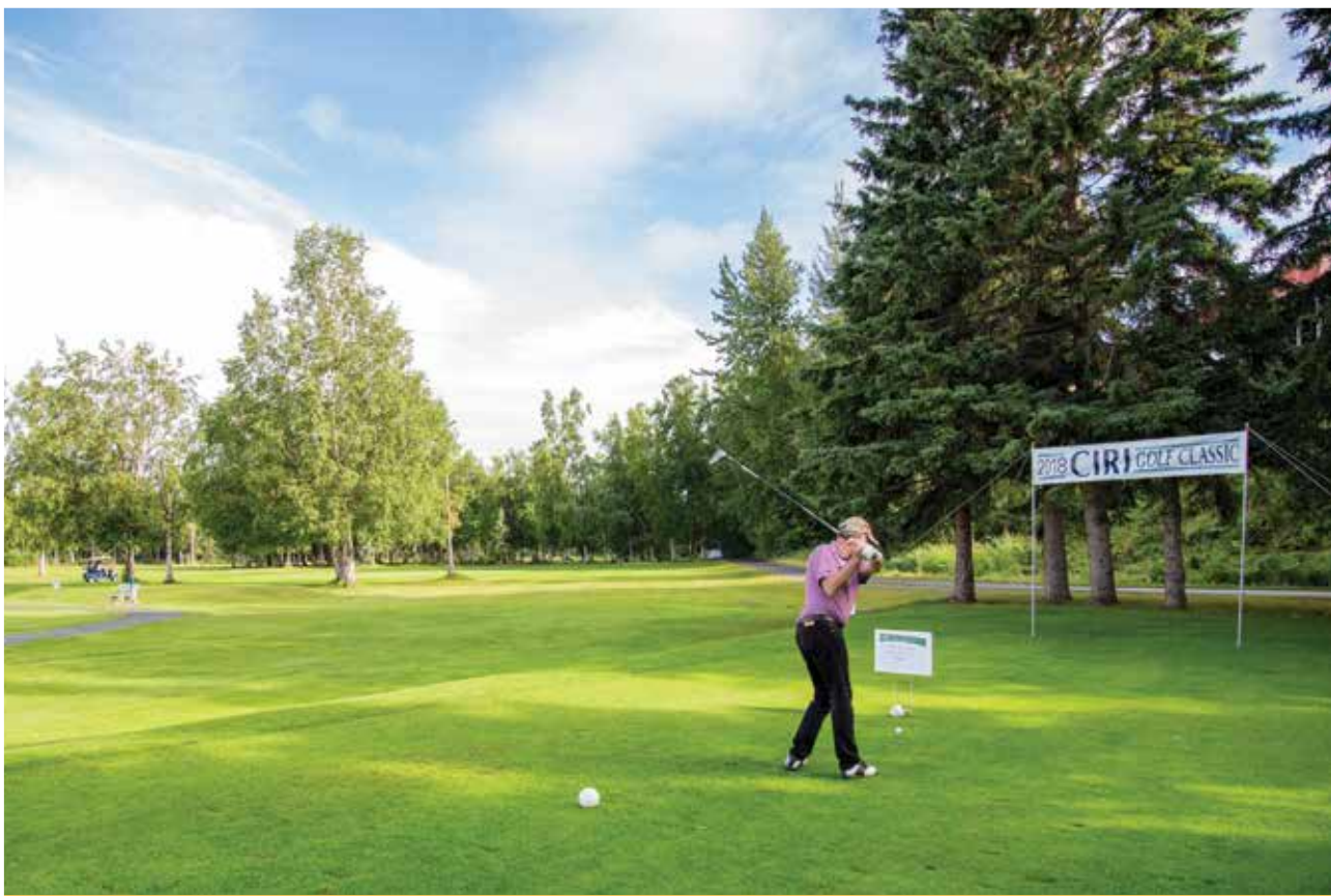
› Tournament participants enjoyed clear skies and warm weather.