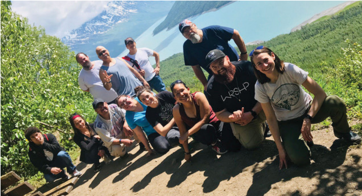
› The Recovery Through Adventure crew stops to pose on a hike up Twin Peaks at Eklutna Lake.