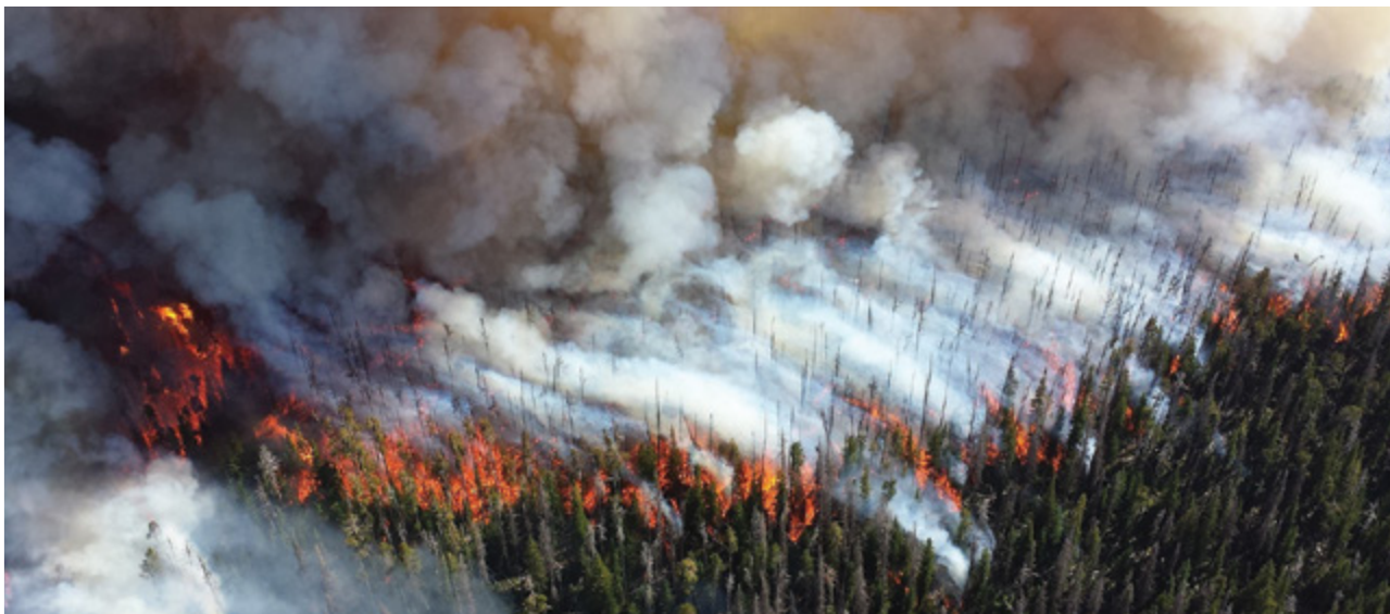
Record-breaking temperatures and dried-out vegetation set the stage for major fires in much of Southcentral Alaska this summer, with 2.5 million acres burned.