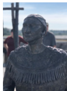
The Interpretive Wayside features a woman in bronze modeled after Grandma Olga Nikolai Ezi, an Ahtna Athabascan Elder.

The installation is open to the public and may be viewed at the Ship Creek small boat launch, located at 25 Small Boat Launch Road in Anchorage.