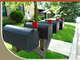
2020 U.S. Election: Vote by Mail