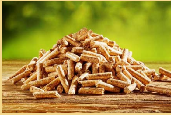
Earlier this year, CIRI became an investor in the Enviva Holdings wood biomass fuel enterprise. The company's seven plants produce over 3 million metric tons of wood pellets annually.

For more information, visit envivabiomass.com .