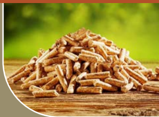
Wood Biomass Fuel Investment