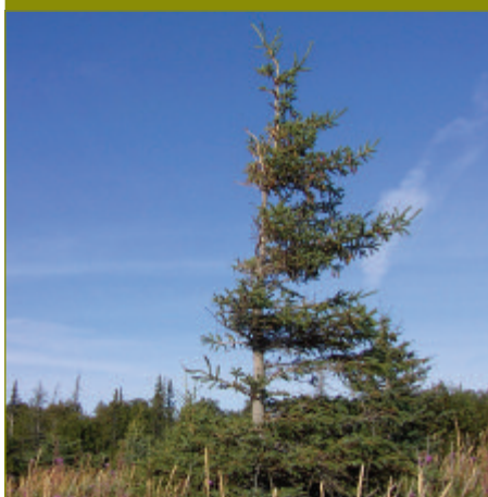
Trees such as this one that line the coast of Fire Island provide a telling natural clue to the wind capacity. The tree branches and needles wear off on one side over time from wind exposure.