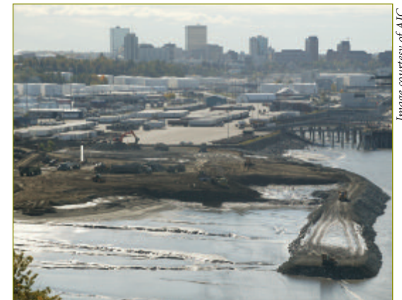
Alaska Interstate Construction LLC constructs a 25-acre expansion of the Port of Anchorage.

AIC has transported from the Elmendorf source approximately 400,000 yards of fill material for the expansion, and hauled about 100,000 yards of shot rock from a quarry in Chugiak to construct the dike.