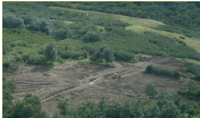
An aerial view of Precision Power raising one of the wind testing towers on Fire Island.