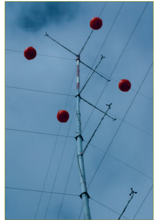
This 60-meter tower on Fire Island is equipped with anemometers, or wind measuring instruments, at different levels to measure wind at various heights. The orange balls warn aircraft from colliding with the tower.

CIRI, as the majority landholder on Fire Island, continues to explore the feasibility of a major wind project on the island. CIRI and Chugach are working with the Federal Aviation Administration to resolve challenges the wind turbines might pose to radar and other airplane navigation systems.