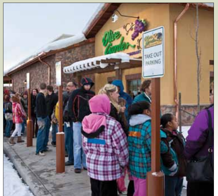
A crowd wraps around the restaurant on opening day.

Tikahtnu Commons is located on CIRI land in northeast Anchorage and is Alaska's largest shopping and entertainment center. The Olive Garden restaurant at Tikahtnu Commons is now accepting applications for employment. Visit www.OliveGarden.com/Careers to learn more.