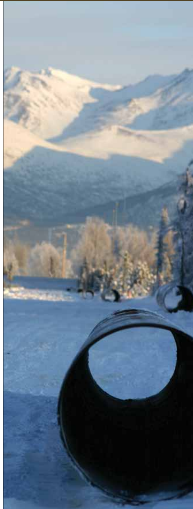
Pilings for the overhead transmission line to Fire Island were prepared for installation near Minnesota Drive and Jewel Lake on Jan. 19. No trail closures are anticipated at this time. Learn more about the Fire Island wind project by visiting www.fireislandwind.com .