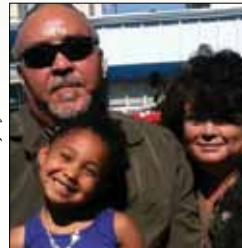
The Padilla family