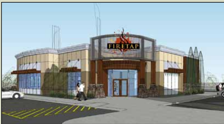
Firetap Alehouse Restaurant is expected to open its new location at Tikahtnu Commons in late August.

Our Company is also making significant progress on other business fronts. Our underground coal gasification project with Laurus Energy Inc. will soon start its design and permitting phase. We anticipate that this project will produce syngas from otherwise unrecoverable, deeply buried underground coal on CIRI lands on the west side of Cook Inlet. CIRI executives are evaluating options for marketing syngas from the project and are working closely with the Board to determine the best way to proceed. This project offers incredible opportunities for CIRI because it is at the forefront of a new domestic energy industry that promises to reduce Alaska's and the nation's dependence on imported energy.