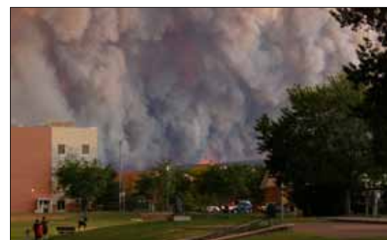
The Las Conchas New Mexico wildfire threatens the Los Alamos National Laboratory and town site.

North Wind environmental and engineering project consultants have been mandatorily evacuated from Los Alamos National Laboratory and the Los Alamos town site. Drought conditions there have caused the threatening Los Conchas New Mexico wildfire to grow to more than 90,000 acres since the blaze started on Sunday, June 26. North Wind Inc., a CIRI-owned nationwide environmental remediation, engineering, project management and construction services company, reports that its New Mexico-based employees are safe and that many have opened their homes to displaced residents.