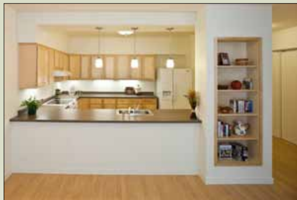
Eklutna Estates homes feature open floor plans and quality craftsmanship.