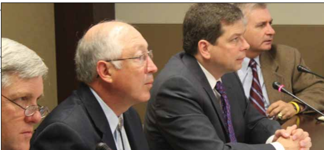
CIRI hosted a talk about Alaska energy development with political and Alaska business leaders. From left is Deputy Sec. David Hayes, U.S. Interior Sec. Ken Salazar, Sen. Mark Begich and Sen. Jack Reed (D-Rhode Island).

Photo courtesy of the Office of U.S. Senator Mark Begich