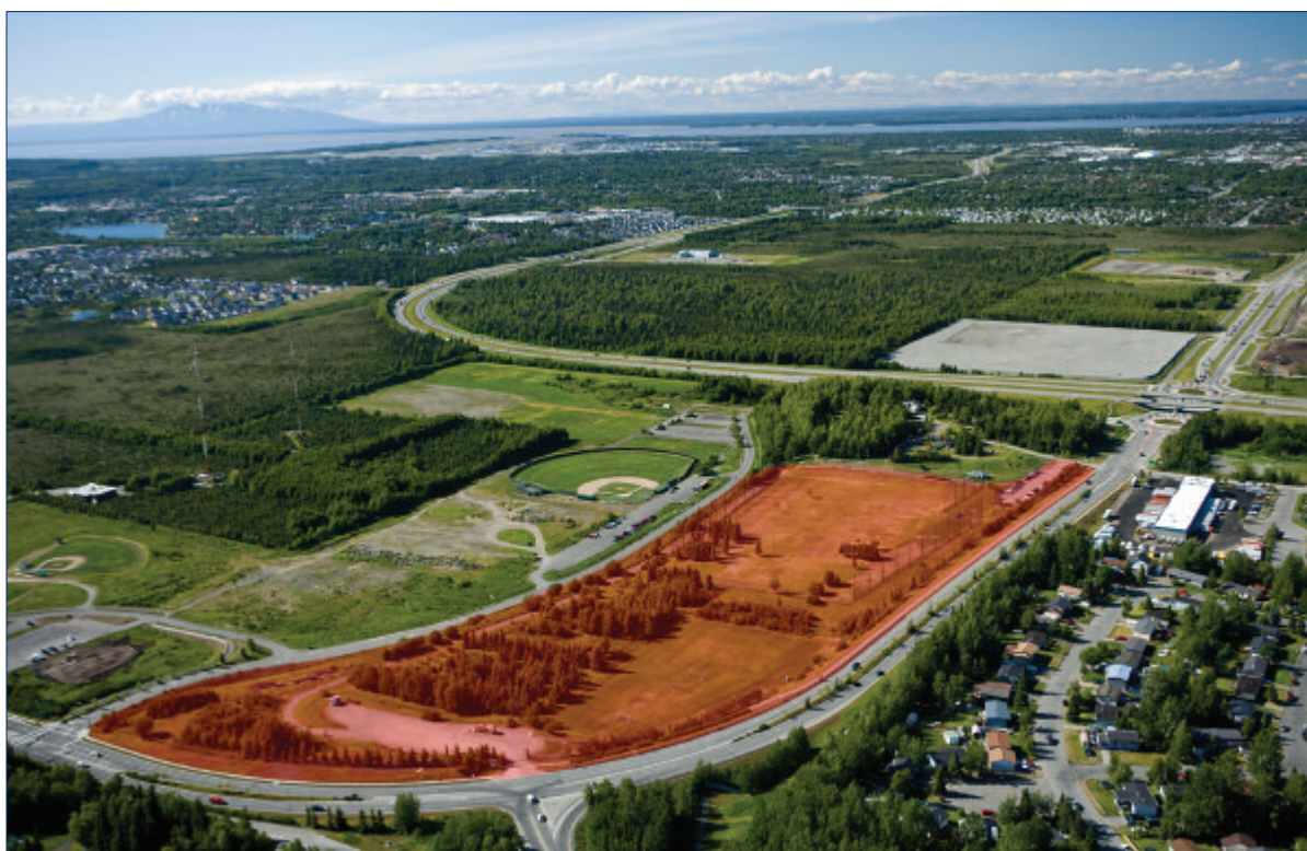
CIRC Land Development Co. is developing its parcel of land in South Anchorage into an office and retail park (shaded in red). The property is near the intersection of C Street and O'Malley Road.