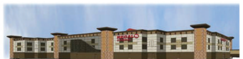
Architect’s rendering of the front exterior (above) and the rear exterior (below) of Regal’s new 16-screen theater now under construction at Tikahtnu Commons, CIRI and Browman Development Co.’s retail and entertainment center in northeast Anchorage.