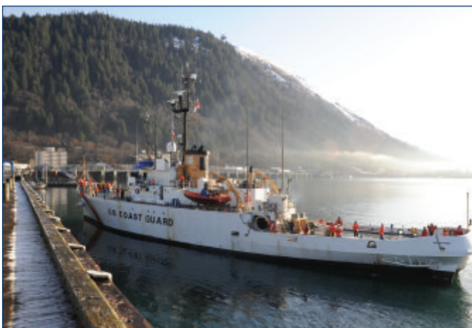
The Coast Guard Cutter Acushnet in port in Juneau, Alaska, on Feb. 19.

The contract, an 8(a) competitive award, has a maximum value of $35 million over a 7-year period or could be up to $5 million per year. ANC Northern will