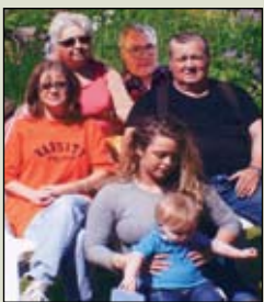
Kelly family and descendants