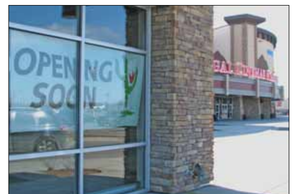
Qdoba is constructing a new restaurant adjacent to the Regal Tikahtnu Stadium 16 IMAX theatre at Tikahtnu Commons, Alaska's largest shopping destination.