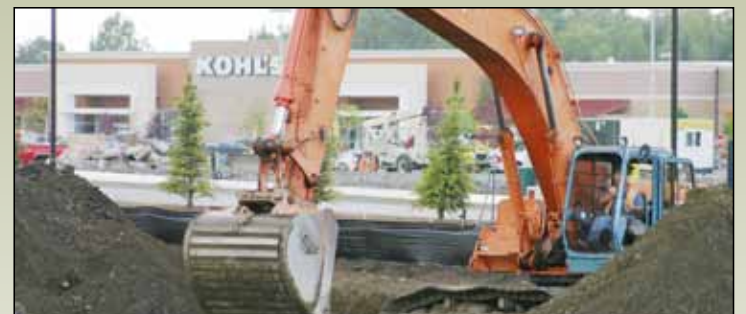
A new Olive Garden is being built at Tikahtnu Commons. CIRI Land Development Co. is teamed with retail developer Browman Development Co. to develop Tikahtnu Commons on 95 acres of CIRI land in northeast Anchorage.

The new Olive Garden will join Tikahtnu Commons' existing dining establishments Firetap Alehouse Restaurant, Fruitland Fresh, International House of Pancakes, Marble Slab Ice Cream, Pho Saigon, Qdoba Mexican Grill, Red Robin Gourmet Burgers and Subway. Construction on a McDonald's restaurant, expected to open late October 2011, is also underway.