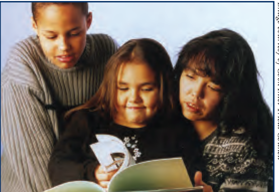
CIRI nonprofit organizations provide social, educational, cultural and employment services in the Cook Inlet region and are included in the Alaska Permanent Fund's "Pick-Click-Give" charitable giving program.

While the CIRI family of nonprofit organizations provides services for Alaska Natives and Native Americans, all Alaskans in Southcentral Alaska benefit indirectly from their programs. The "Pick-Click-Give" program also includes other Alaska Native organizations, such as The Aleut