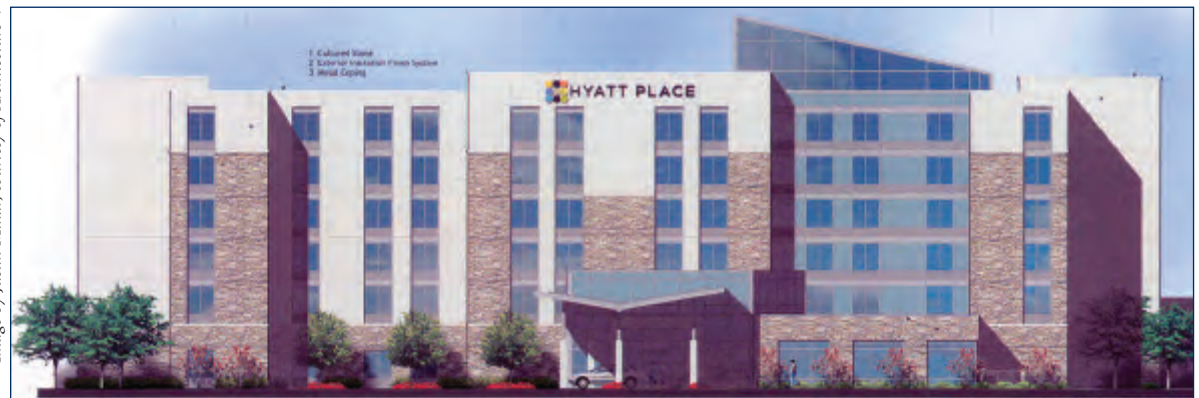
This architectural rendering shows the front side of the Hyatt Place hotel being constructed at CIRI Land Development Co.'s Sonterra office park development in San Antonio, Texas.

Hyatt Place targets burgeoning San Antonio business district