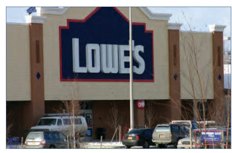
Lowe's new home improvement store at Tikahtnu Commons opened on April 1. The national retailer is among the many shops and stores opening at the Northeast Anchorage retail center throughout 2009 and 2010.