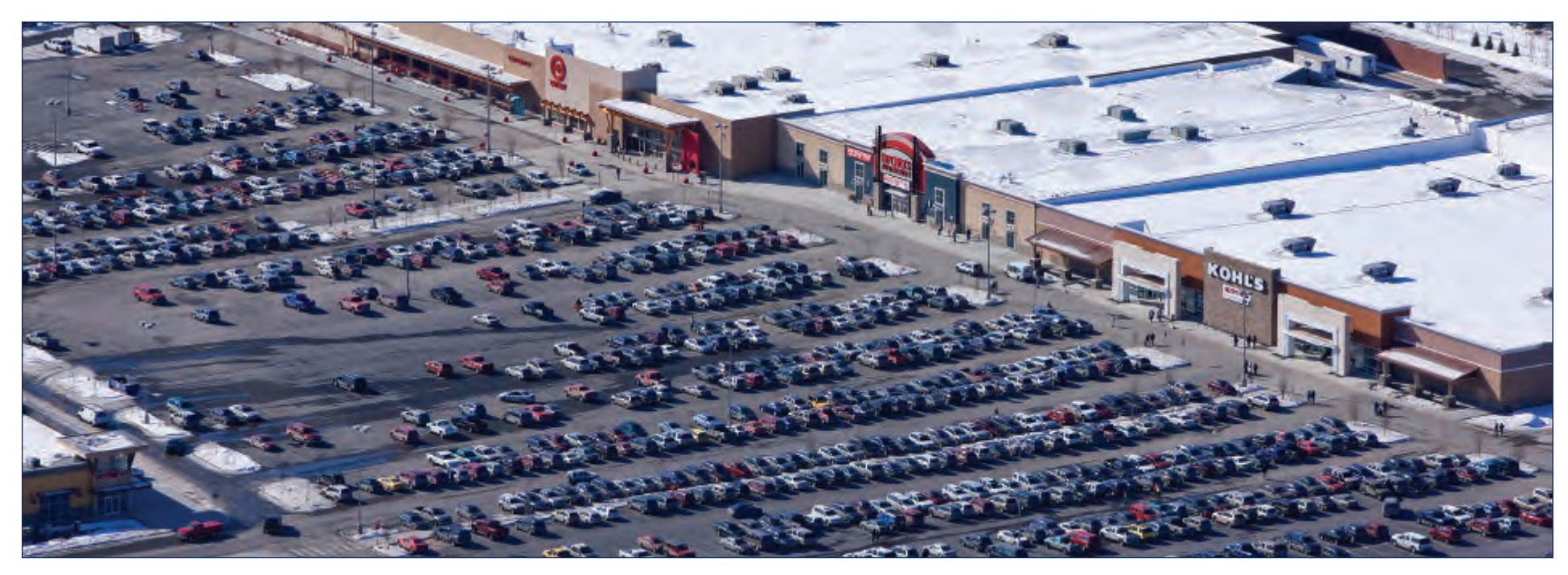
Kohl's Department Store, shown at far right, opened at Tikahtnu Commons on April 1. The national retailer is among many stores and shops that will be opening at the Northeast Anchorage retail center throughout 2009 and 2010, including Sports Authority (second from right). The Target store (far left) opened on Oct. 9, 2008.