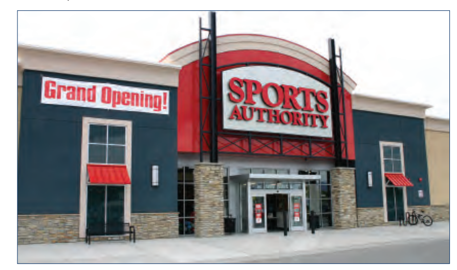
Sports Authority opened a new store at Tikahtnu Commons on May 9.

Creek, Calif.-based Browman Development Co. The retail center is located on a 95-acre parcel of CIRI land acquired as a result of the Cook Inlet Land Exchange. Tikahtnu Commons is expected to include 12 to 15 major retail stores and numerous smaller stores, restaurants and other businesses. Construction of the retail center began in 2007 and is expected to last five to seven years.