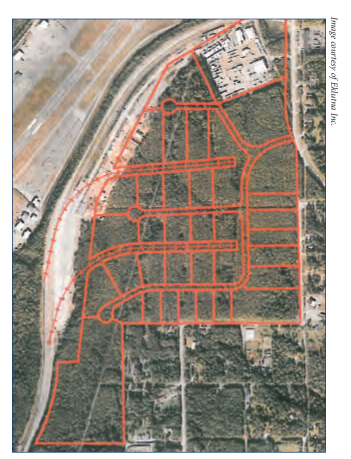
Diagram of Eklutna's proposed industrial park in Birchwood, Alaska. CIRI will extract sand and gravel from the site prior to development.

Eklutna Inc. and CIRI have worked cooperatively to bring the pieces of the project together for the benefit of all participants and to provide a needed resource to the market. This project is the second