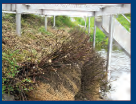
Two 24-foot gratewalks were installed on CIRI land at the banks of the Ninilchik River at Brody Bridge to protect the restoration work and regrowth.

located at their weir site on CIRI land at Brody Bridge on the Ninilchik River. The purpose of the June workshop was to provide technical education about fish habitat and restoration techniques. During the seminar, approximately 50 feet of impacted fish habitat was restored using bio-engineered techniques, including brush techniques similar to the North Fork of Deep Creek project discussed above. In addition, two 24-foot by 8-foot elevated