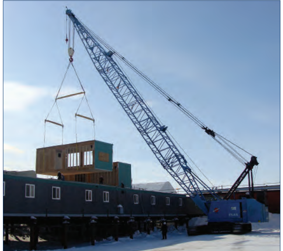
Peak has a large and versatile fleet of heavy cranes ranging from 50 to 300 tons that support a variety of oilfield development and maintenance activities.

CIRI/Nabors subsidiary provides services for new oil, development fields on the Slope