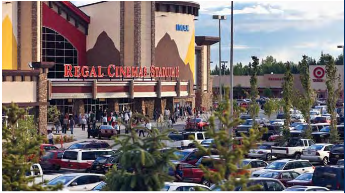
Anchorage moviegoers pack the parking lot of Regal's new Tikahtnu Stadium 16 & IMAX theater at Tikahtnu Commons on June 15. The theater opened with special preview events on June 7, 8 and 10 and a grand opening on June 11.