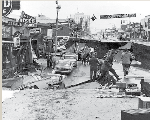
› 1964 earthquake damage on 4th Avenue in downtown Anchorage.

The BCP outlines exactly what CIRI departments and employees need to do to make sure the company's essential operations continue to function in the face of a catastrophic event or disruption of services at the CIRI building. Once the immediate health, life and safety issues of our employees are taken care of, our priority is getting back to fulfilling the mission of CIRI: to promote the economic and social well-being of our shareholders.