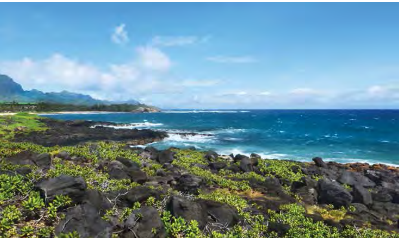
▶ A view from Makahuena Point in Kauai, Hawaii, where CLDC was recently given approval to move forward with its proposal to develop this property.

CLDC's tentative plans are to subdivide 25 lots into 10 one-acre or larger parcels that will be either sold to individual landowners or to a developer who will construct single-family homes. A visual and view plane analysis will be conducted to determine where the homes should be placed on their respective lots to minimize the effect the development may have on the scenic views from nearby properties. The houses are expected to have a footprint of approximately 4,000-square-feet, with a maximum height of 30 feet, with no more than two stories. 📄