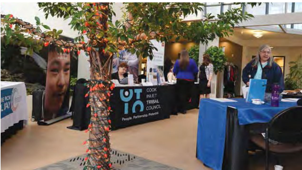
Early attendees check out vendors in the CIRI Building's atrium during the second annual CIRI Shareholder Job and Resource Fair, which saw 50 percent more attendees than last year's event.