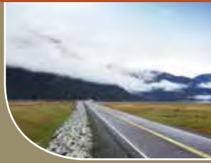
North Wind proves its performance | 06