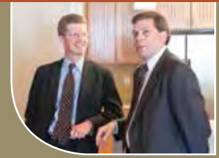
Big win for Cook Inlet Housing | 08