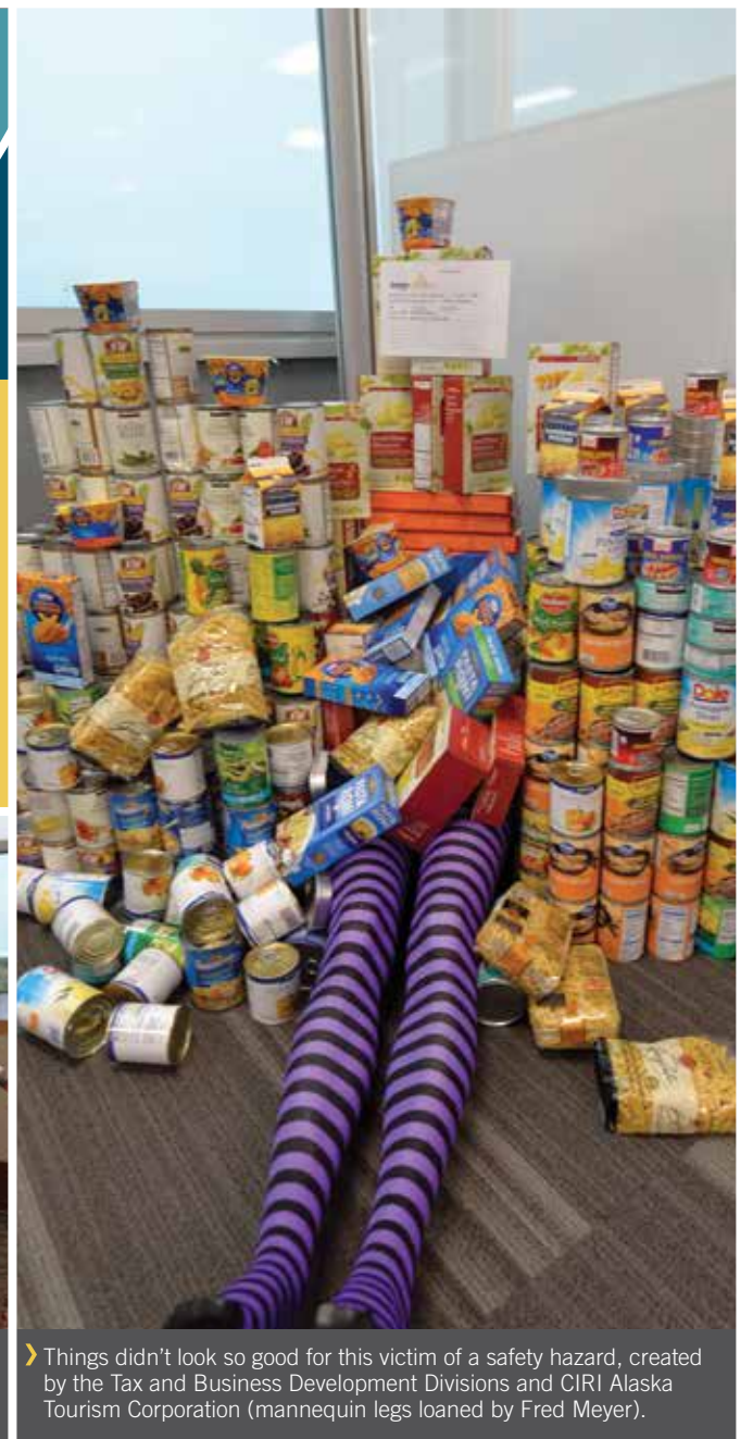
› Things didn't look so good for this victim of a safety hazard, created by the Tax and Business Development Divisions and CIRI Alaska Tourism Corporation (mannequin legs loaned by Fred Meyer).

CIRI employees love a challenge, so when the Accounting Department raised $220 for The Children's Lunchbox, a nonprofit that provides nutritious food for hungry children, the Shareholder Relations Department felt that the gauntlet had been thrown. Not to be outdone, Shareholder Relations issued a challenge: The Hunger Games. CIRI departments teamed up to collect canned goods for donation, then designed and constructed sculptures from their cans. Teams competed in several categories, including "complexity," "creativity" and "quantity." CIRI hosted a lunch for the winning teams, with Shareholder Relations providing desserts as a thank-you. But the real winner is the Food Bank of Alaska, who received a total 3, 580 pounds of canned goods and coffee once the sculptures were disassembled.