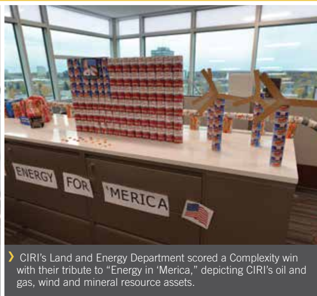
› CIRI's Land and Energy Department scored a Complexity win with their tribute to "Energy in 'Merica," depicting CIRI's oil and gas, wind and mineral resource assets.