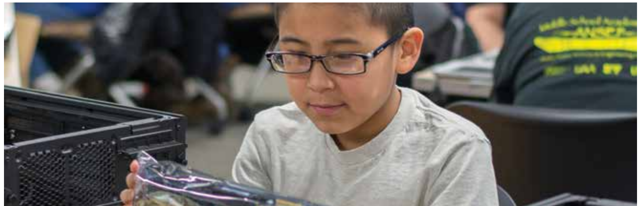
▶ ANSEP prepares Alaska Native students to succeed in engineering and science careers.

A 12-year-old from Napakiak, Alaska, who dreams of being the first engineer from her village has a lot of obstacles to overcome—even in a state where science, technology, engineering and math (STEM) industries make up a significant portion of the economy.