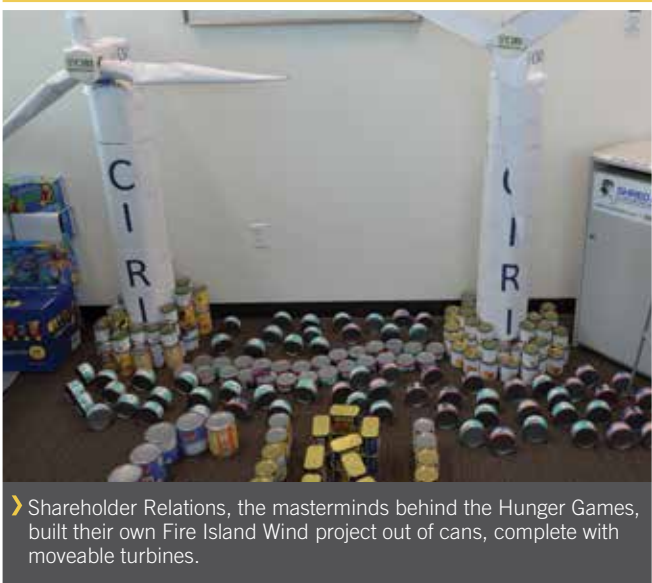
› Shareholder Relations, the masterminds behind the Hunger Games, built their own Fire Island Wind project out of cans, complete with moveable turbines.