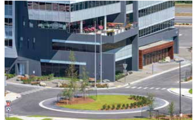
▶ Stantec will begin occupying the second floor of the Fireweed Business Center beginning January 2016.

CIRI occupies the seventh and eighth floors and half of the sixth floor of the Fireweed Business Center, or roughly 40 percent of the building. With Stantec occupying the entire second floor, floors four and five and portions of the first and third remain available for lease. 📄