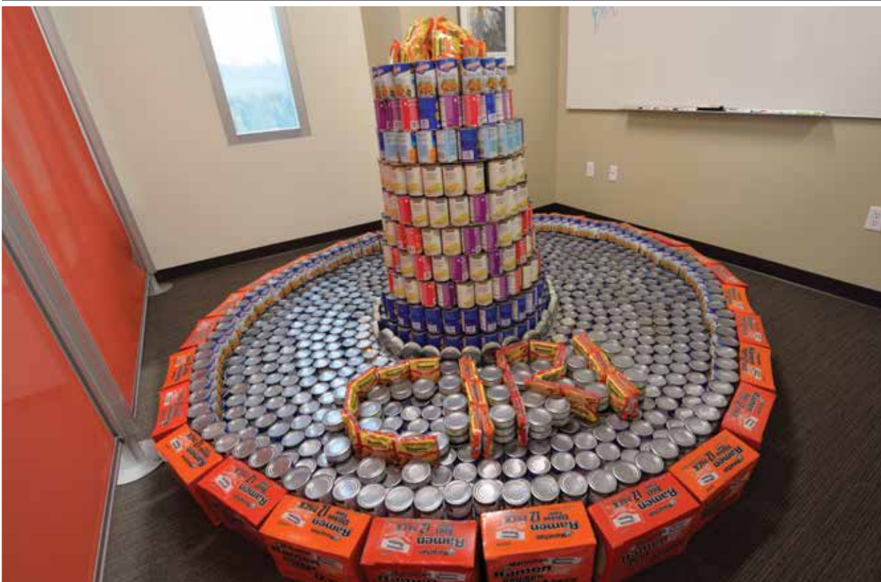
› After successfully negotiating a bulk quantity discount with Walmart, Human Resources, Risk Management and Government Services successfully collected the most canned goods (1,878!) to create a colorful sombrero, landing the Quantity prize.