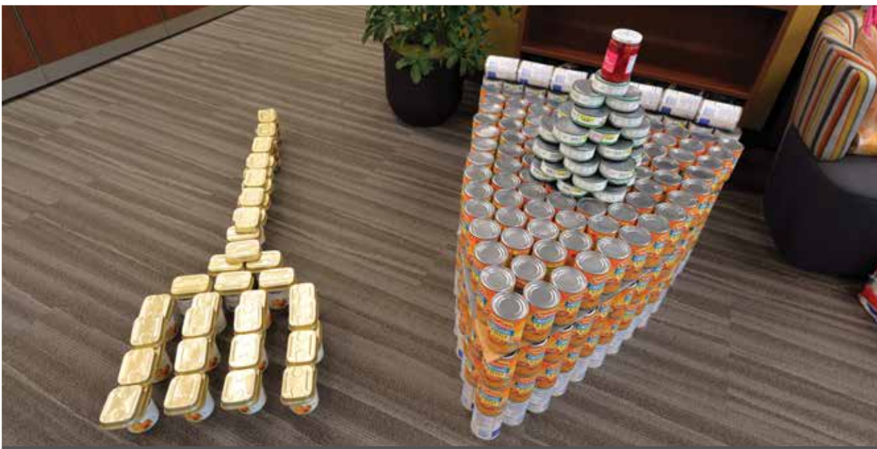
› CIRI's Accounting and Finance Departments collaborated to serve up a piece of pie—and a fork to it eat with.