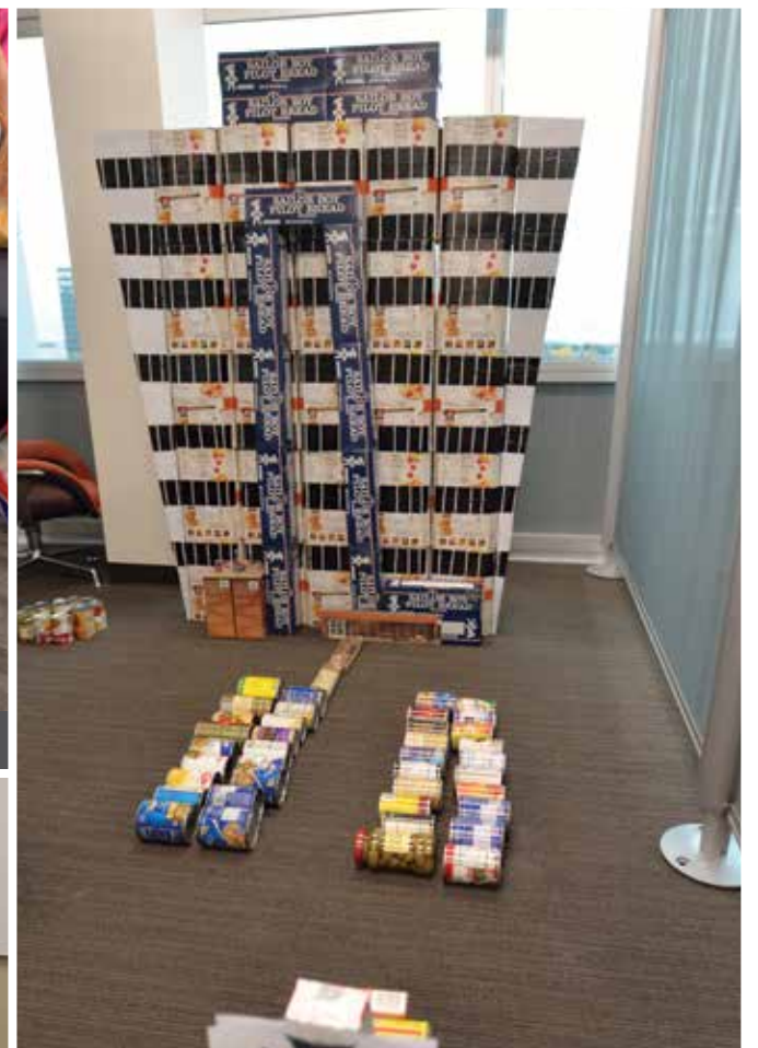
› The Legal and Real Estate Departments won for Creativity with their replica of the Fireweed Business Center, including the deck, roundabout and even China King in the parking lot.