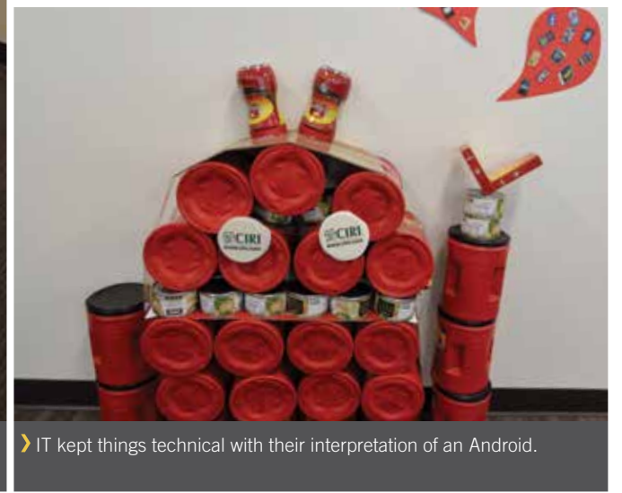
› IT kept things technical with their interpretation of an Android.