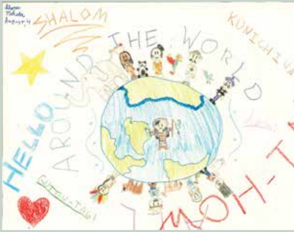
➤ Aleshanee Katherine Nikita received second place in the ages 9 to 12 category in the 2014 Youth Art Contest.

To enter the 2016 Youth Art Contest, CIRI shareholders or confirmed, registered descendants aged 5 to 12 must submit original artwork interpreting the theme "What do you want to be when you grow up?" along with a completed