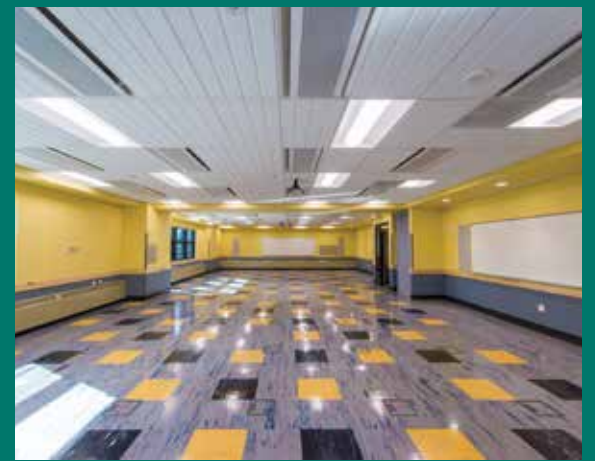
► The 20,000-square-foot structure contains 3,000 square feet of classroom space.

The battalion headquarters was fully designed by the U.S. Army Corps of Engineers; as such, Silver Mountain was required to have a superintendent/site safety and health officer and quality control manager on site at all times. All told, Silver Mountain dedicated 730 days to the project from the time of award in May 2014 to the time of completion, May 8, 2016.