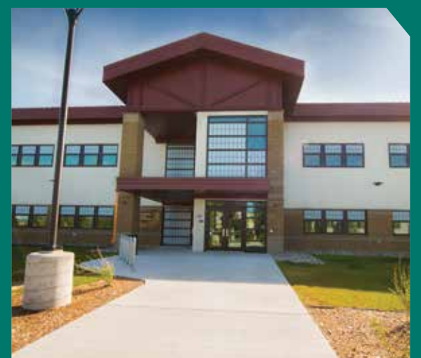
➤ Construction of the battalion headquarters at Fort Wainwright was completed in May 2016.

U.S. ATTORNEY GENERAL, CONTINUED ON PAGE 07