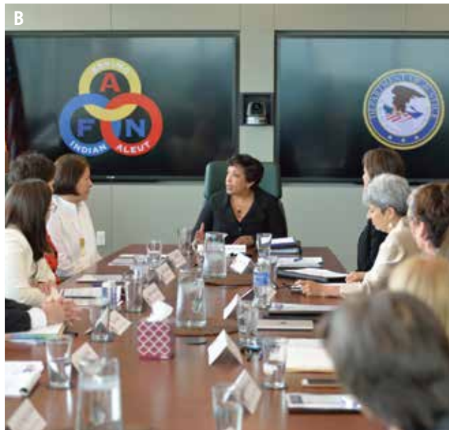
➤ A. U.S. Attorney Loretta Lynch said she hopes to generate more dialogue between the Department of Justice and Native leaders. B. Lynch discusses issues of public safety with Alaska's tribal leaders June 10 at CIRI's Fireweed Business Center.