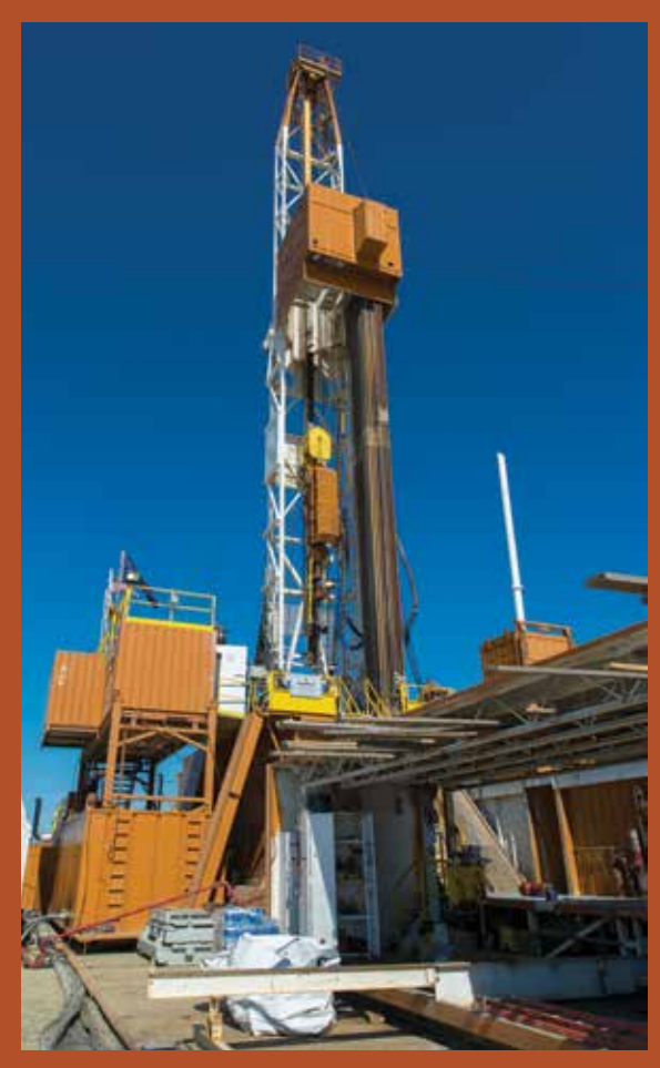
> The Toghotthele drill site, a 2016 partnership between Doyon and CIRI.

Targeting a promising oil and gas prospect, CIRI will join fellow Alaska Native regional corporation Doyon, Limited (Doyon) in drilling the Totchaket #1 well this summer. The oil and gas exploration well will be located in the Nenana basin west of Fairbanks, Alaska. Its location is based on data acquired from a 64-square-mile 3D seismic program conducted in 2017.