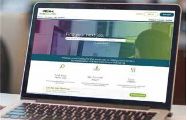
) Some of the opportunities, programs and resources for CIRI shareholders and descendants include (left to right) the annual Job and Resource Fair, the CIRI C3 Experience, SPC youth representative positions and AlaskaNativeHire.com.

For 45 years, CIRI has developed business ventures across Alaska and beyond, with the well-being of current and future shareholders at the center of every decision. CIRI supports its shareholders and their descendants with employment resources, Alaska Native artist opportunities and a variety of youth programs.