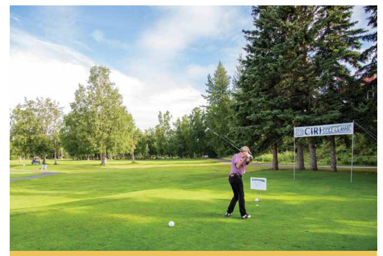
) Tournament participants enjoyed clear skies and warm weather.