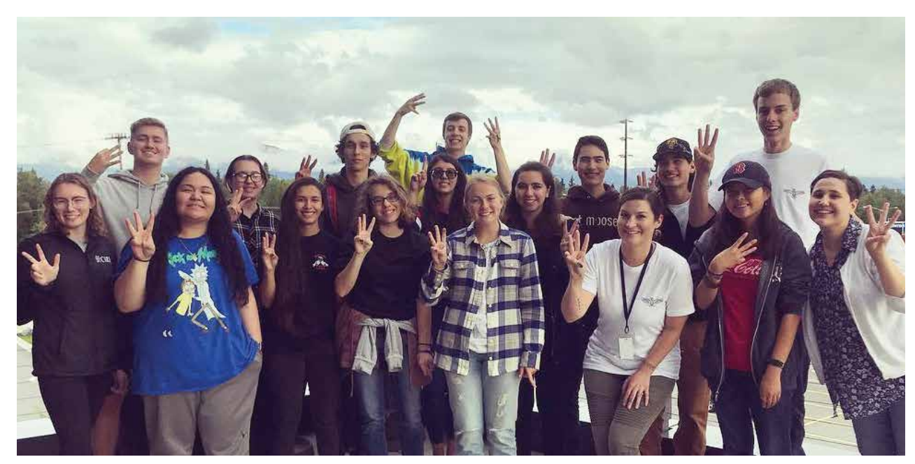
• Fifteen young shareholders and descendants turned out for the CIRI C3 Experience, held Aug. 13 to 15 in Anchorage and at Birchwood Camp in Chugiak. Alaska.