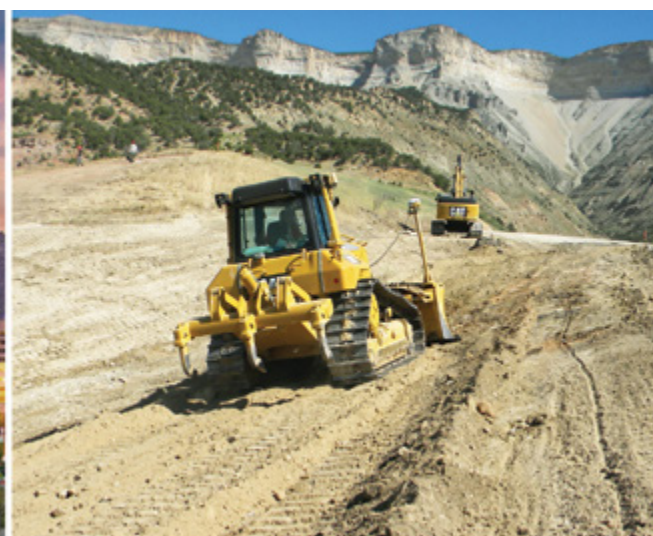
CIRI delivered solid financial performance in 2018. Low vacancy rates, coupled with historic-low interest rates, fueled strong value appreciation in the company's Arizona real estate portfolio, allowing it to harvest growth in properties that had reached stabilization. The company's government services sector, anchored by CIRI subsidiary North Wind Group, also boasted an excellent year.