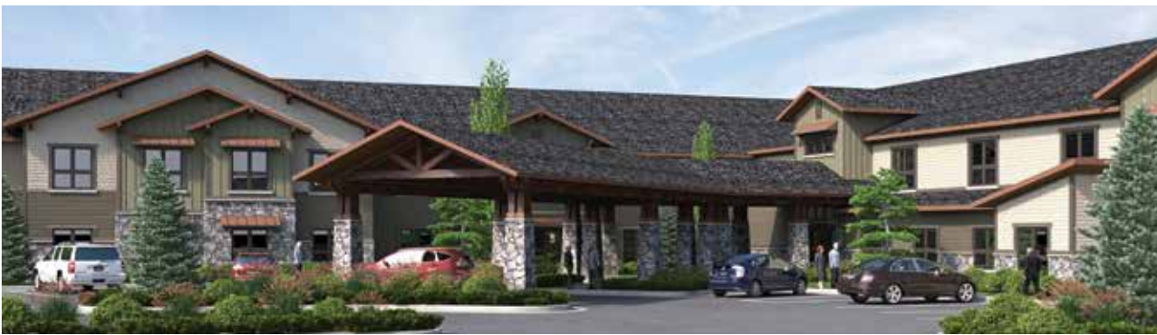
▶ A rendering of the Maple Springs of Anchorage project, a 107,756-square-foot assisted living and memory care facility due to be completed in 2021.