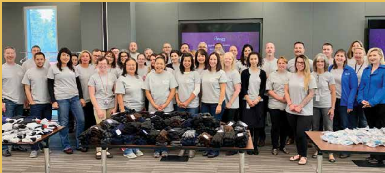
› Ciri employees assembled 200 blessing bags as part of the company's Values Week celebration, held Sept. 23-27.