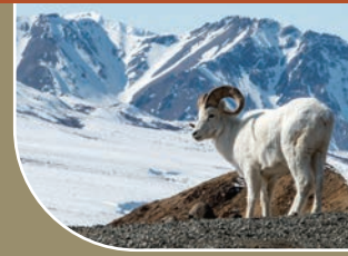
Farewell Sheep Hunting Permits