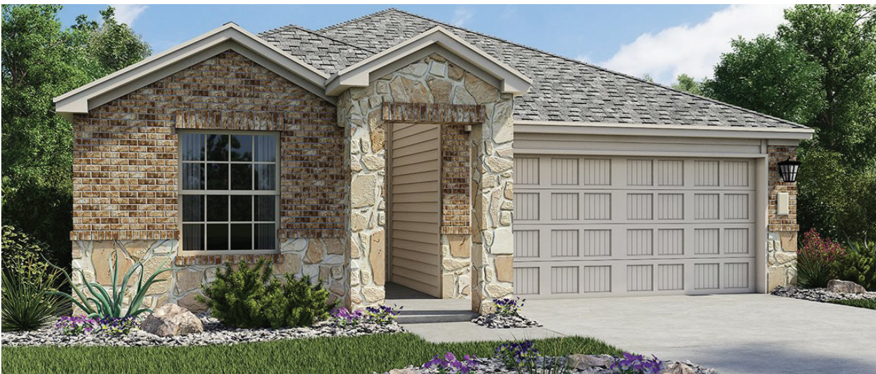
› Escondido North is a subdivision with builders providing high-quality homes at entry-level prices.