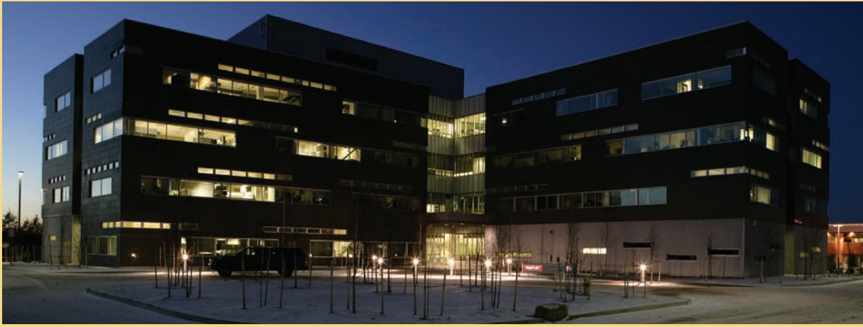
› CITC and ANJC are housed in the newly reopened Nat'uh Service Center in Anchorage.