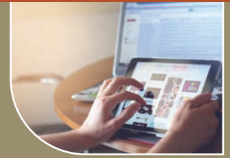
New eNewsletter Participation Prize