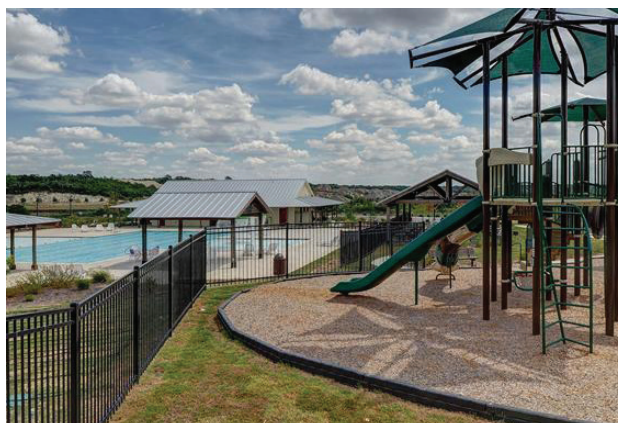
› An amenity center was added to the 1,100-acre Ladera planned community in 2017.

The housing market, along with the rest of the U.S. economy, began its years-long recovery in summer 2009. Things started looking up for Escondido North in 2014, when the second-largest homebuilder in the U.S., Lennar Homes, expressed interest in purchasing the existing finished lots, along with unfinished lots in additional future units. A 2015 sale within the development of an elementary-school site proved a great benefit to the project and helped solidify