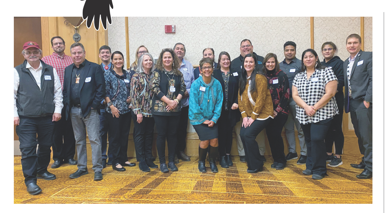
Held Jan. 30-31 in Anchorage, the Cook Inlet Region Leaders Roundtable and Alaska Native Unity Forum brought together leaders from CIRI, the CIRI family of tribally designated organizations, and Cook Inlet region villages and tribes.