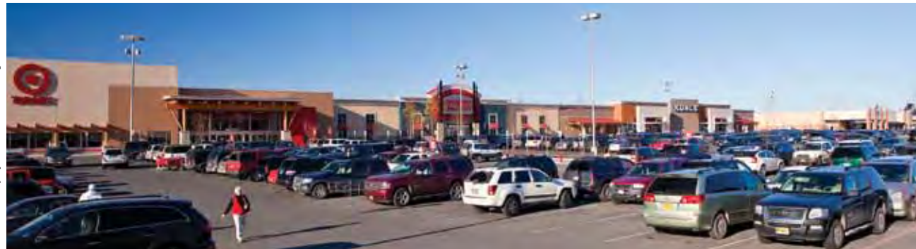
PetSmart will locate its new store next to Kohl's department store. PetSmart will nearly complete the lineup of major stores on Tikahtnu Commons' west side: Best Buy (to the left of Target, not shown), Target, Sports Authority, Kohl's, PetSmart and Lowe's. A 30,000-square-foot pad remains available.

Approximately half of Tikahtnu Commons' one million square feet of retail and entertainment space has been built out. The projected $100-million-plus project when completed could include 12 to 15 major stores and 60 to 75 smaller shops, restaurants and other businesses. CIRI Land Development Co. and its partner Browman Development Co. began developing the center in 2007 on a 95-acre parcel of CIRI land in northeast Anchorage.