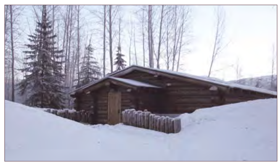
The Alaska Native Heritage Center's new Athabascan Ceremonial house offers gathering space available for rent.

Building is final village site revitalization project