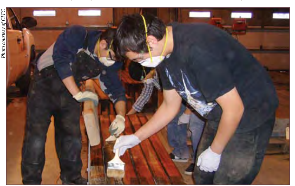
A component of the YouthBuild program is 40 hours of volunteer service. Here, enrollees work on completing a bench for the Municipality of Anchorage.

Five-month program can transform lives of youth