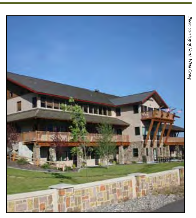
The North Wind Group is a business leader in the environmental, engineering and construction service