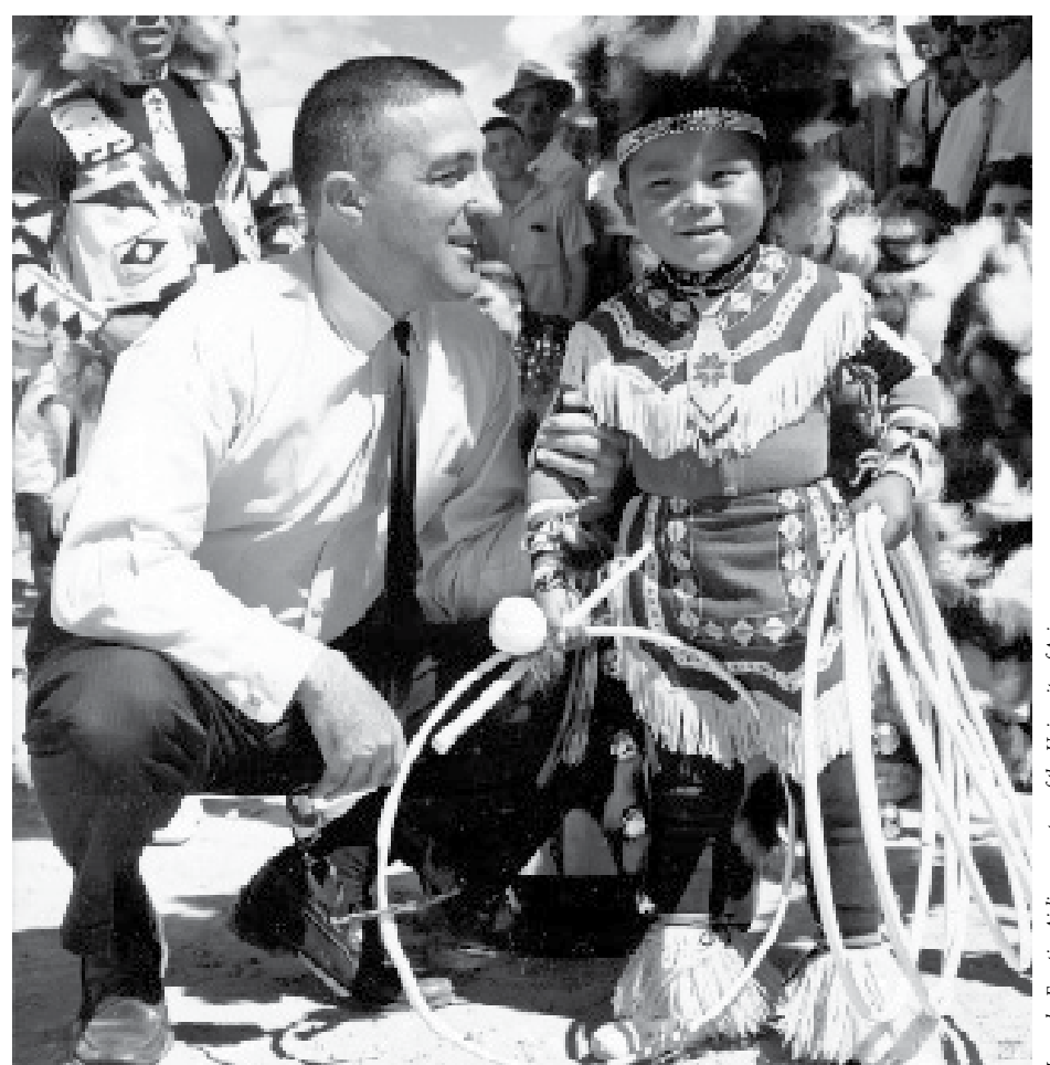
Secretary of the Interior Stewart L. Udall at the dedication of the Navajo Dam, Navajo Trail Highway and Four Corners Marker in New Mexico in 1962.

But for Alaska Native people, he will always be remembered for his principled defense of their land claims and his courageous secretarial order that eventually led to the Alaska Native Claims Settlement Act.