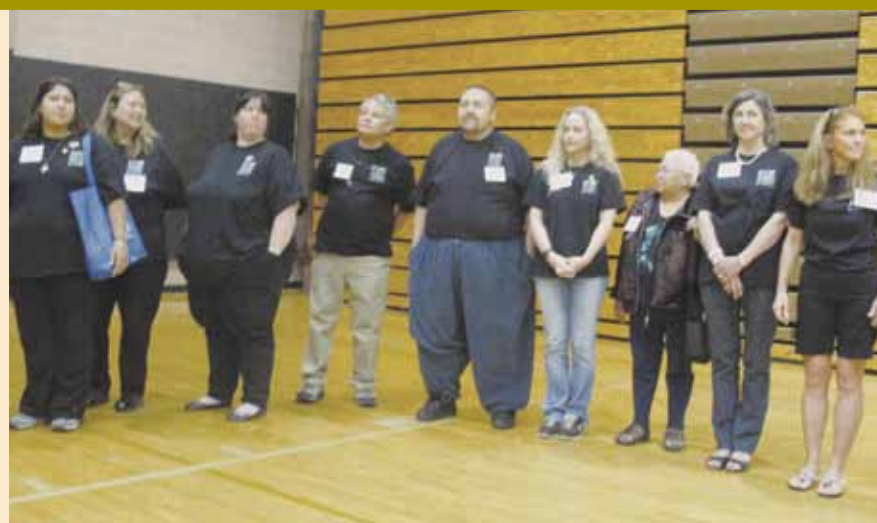
Shareholder Participation Committee members at CIRI's 2010 Annual Meeting in Puyallup, Wash.

Each committee has nine members who are chosen by random drawing from shareholders interested in serving and who have correctly answered a questionnaire. Members generally serve staggered, three-year terms that begin at the time of selection and expire at CIRI's annual meeting three years later.