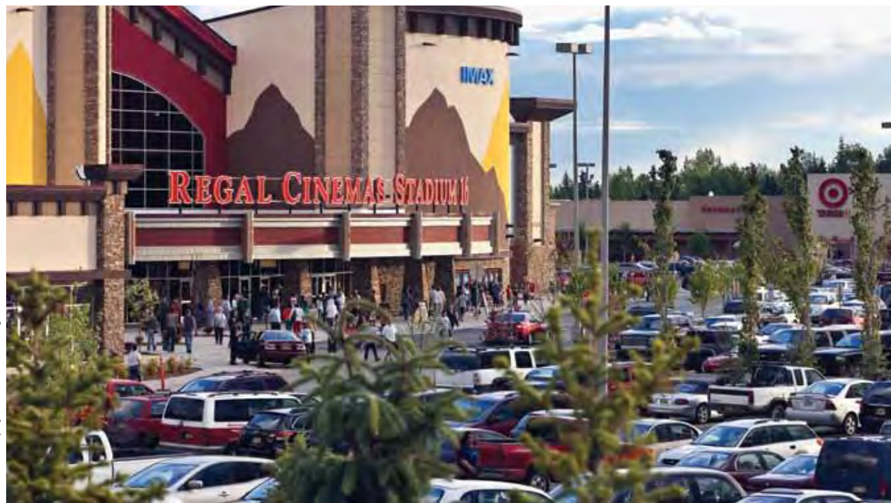
Anchorage moviegoers pack the parking lot of Regal's new Tikahtnu Stadium 16 & IMAX theater at Tikahtnu Commons on June 15. The theater opened with special preview events on June 7, 8 and 10 and a grand opening on June 11.