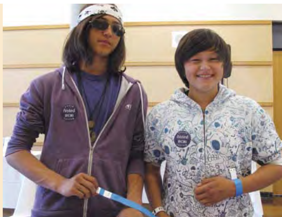
Two potential future shareholders after voting in CIRI's Youth Vote program at the 2010 Annual Meeting in Puyallup, Wash.

A total of 18 youths (10 from the 7-12 grade bracket, and 8 from the pre-K through sixth grade) participated in the program this year. CIRI's Shareholder Participation Committees helped with the youth voting process. Six prizes were given away to youth who participated, including an iPod Nano, iPod Shuffles, and gift cards.