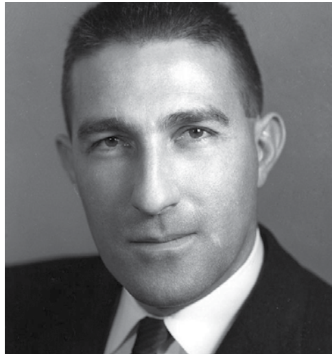
Stewart L. Udall, Secretary of the Interior from 1960 to 1969, passed away March 20. He is remembered by many Alaska Natives for his "land freeze" that allowed the Alaska Native land claims movement to press for and win passage of the Alaska Native Claims Settlement Act.

in the U.S. Air Force as a gunner during World War II. After the war, he earned a law degree and opened a law practice with his brother in Tucson, Ariz. He was elected to Congress in 1954 and served in the U.S. House of Representatives until 1960, when President John F. Kennedy appointed him as Secretary of the Interior. Udall served under both Kennedy and Lyndon Johnson in this role for eight years.