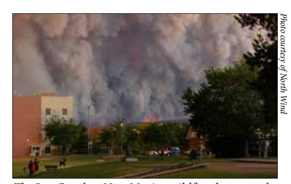
The Las Conchas New Mexico wildfire threatens the Los Alamos National Laboratory and town site.

North Wind environmental and engineering project consultants have been mandatorily evacuated from Los Alamos National Laboratory and the Los Alamos town site. Drought conditions there have caused the threatening Los Conchas New Mexico wildfire to grow to more than 90,000 acres since the blaze started on Sunday, June 26. North Wind Inc., a CIRI-owned nationwide environmental