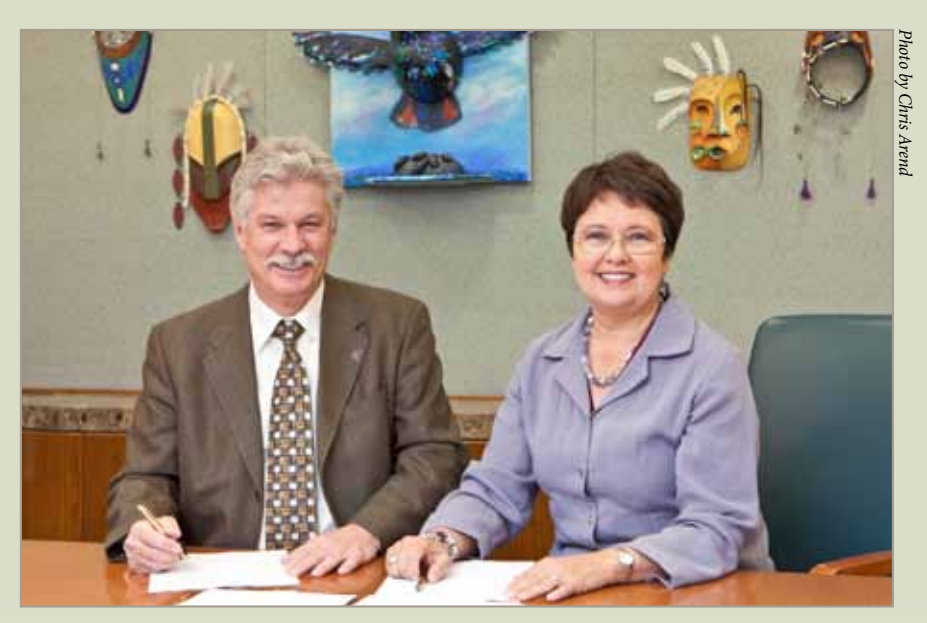
Chugach signed a power purchase agreement for Fire Island wind on June 14. Power production will start late 2012.

construction. Chugach will ask the RCA for accelerated consideration with a final decision before Sept. 15, 2011. CIRI anticipates RCA approval in time to resume construction in 2011 to qualify the project to receive an America Recovery and Reinvestment Tax Act of 2009 Section 1603 grant. The project must be completed, commissioned and producing power before the end of 2012 to receive this federal stimulus grant.