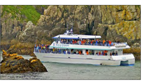
CATC is the parent business of Kenai Fjords Tours, a leading Alaska marine day-cruise company.

Become a Puffin Pass member by visiting www.ciritourism.com/puffinpass.