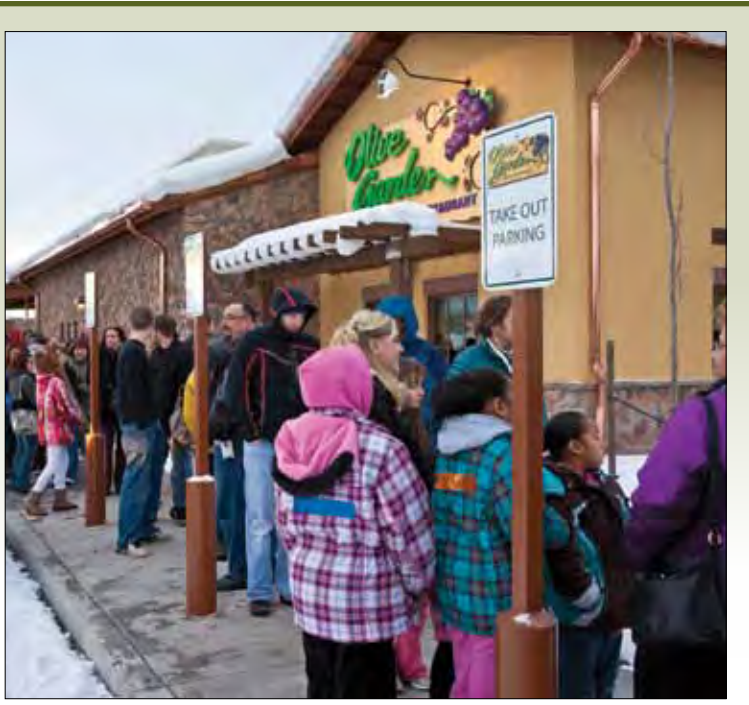
A crowd wraps around the restaurant on opening day.

Tikahtnu Commons is located on CIRI land in northeast Anchorage and is Alaska's largest shopping and entertainment center. The Olive Garden restaurant at Tikahtnu Commons is now accepting applications for employment. Visit www.OliveGarden.com/Careers to learn more.