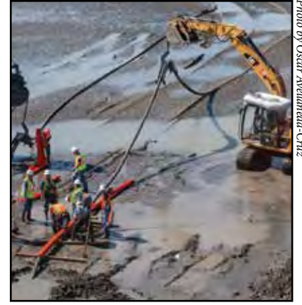
Workers installed submarine transmission cables across Turnagain Arm to the north of Point Campbell.