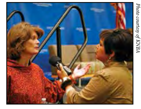
"National Native News" Anchor Antonia Gonzales interviews Lisa Murkowski during the 2011 AFN convention.

Complete audio streaming for mobile devices will also be available at www.knba.org and through Native Voice 1 at www.nv1.org. In addition to the live, gavel-to-gavel coverage, KNBA will produce an hour-long update each day at noon and a one-hour recap at the end of the convention. To learn more about AFN, visit www.nativefederation.org