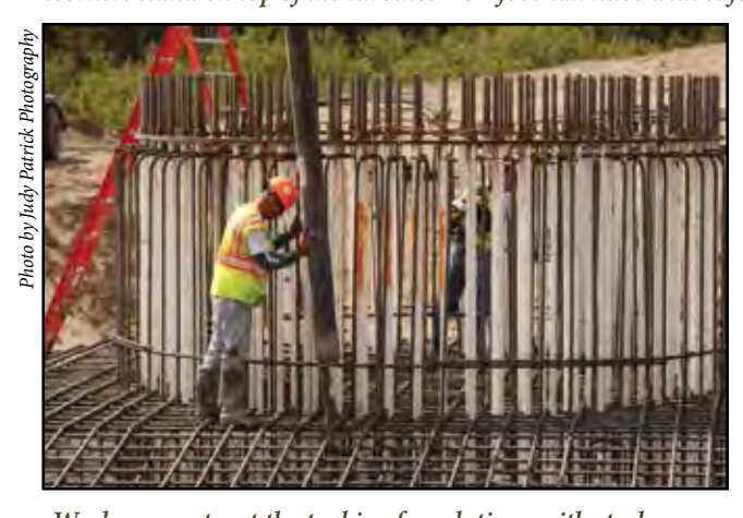
Workers construct the turbine foundations with steel reinforced concrete to support over 162 tons of weight that each fully assembled turbine is estimated to weight.