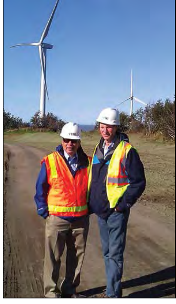
Senator Begich and Senator Wyden (D. Oregon) touring the Fire Island Wind farm.

Fire Island Wind hired Upwind Solutions to help operate and maintain the wind farm. Developing and constructing the project involved nearly 100 businesses, most of which are either based or have substantial operations in Southcentral Alaska. The project created more than 100 local project development and construction jobs this year. Anchorage-based Northern Powerline Constructors Inc., for example, built the