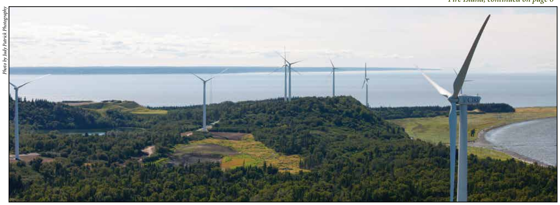
The Fire Island Wind project's first phase includes 11 turbines. All turbines are complete and are expected to be commissioned by late September.