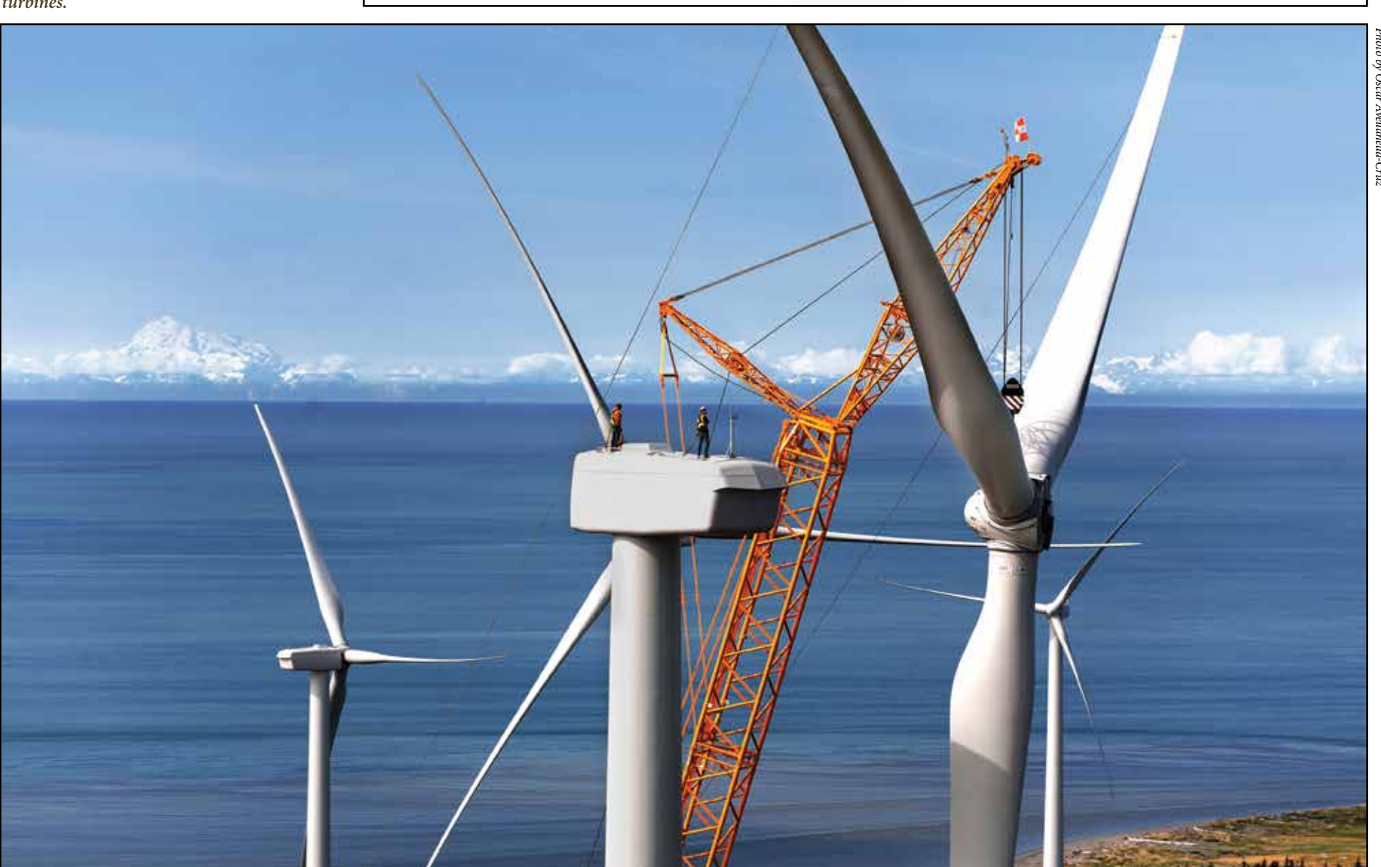
Workers stand on top of the turbines' 262-foot-tall hubs with safety straps and harnesses to direct each turbine rotor assembled with the only 660-ton crane in Alaska.