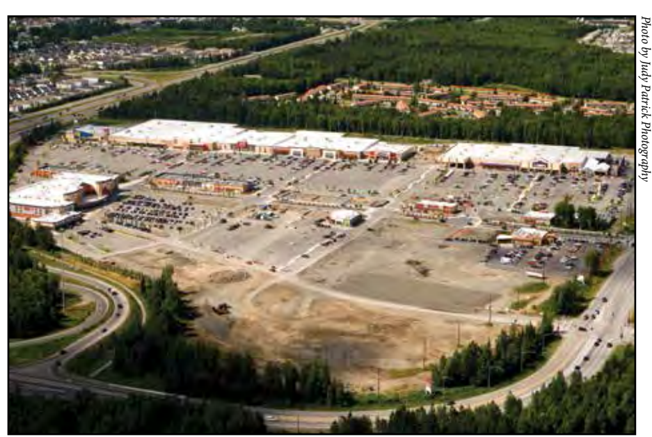
Sam's Club began construction on the undeveloped northeast corner of Tikahtnu Commons.