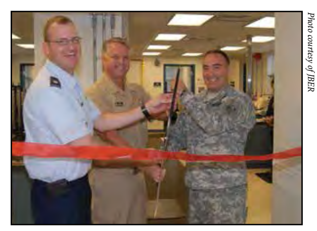
Defense Logistics Agency fuels laboratory ribbon cutting at Joint Base Elmendorf Richardson.

Weldin Construction Services is a CIRI Services Corp. company that provides construction and construction management