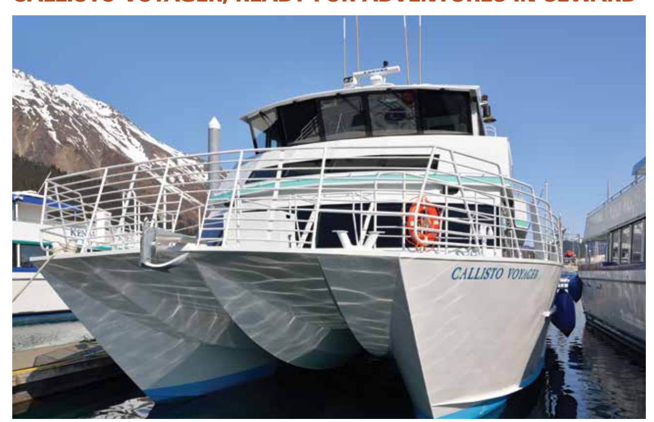
The M/V Callisto Voyager in Seward, Alaska.

Kenai Fjords Tours' (KFT) new state-of-the-art catamaran, the M/V Callisto Voyager, is officially on the water. The vessel was launched in Washington, where it went through a series of standard tests before the journey to Seward, Alaska.