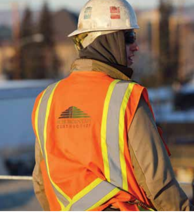
(Left) The Battalion Headquarters Building under construction at Fort Wainwright. (Right) An iron worker on the job at Silver Mountain Construction's project at Fort Wainwright. (Below) Overlooking the Battalion Headquarters Building at Fort Wainwright.