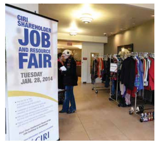
CIRI's third annual Job Fair will take place Thursday, Jan. 29, 2015, and will include a selection of interview-appropriate clothing and accessories for shareholder and descendant use.

Tune in to KNBA 90.3 FM or listen online at www.knba.org for updates as the job fair approaches. For questions or to RSVP, please contact CIRI's Human Resources department at hrreplies@ciri.com or (907) 274-8638. ■