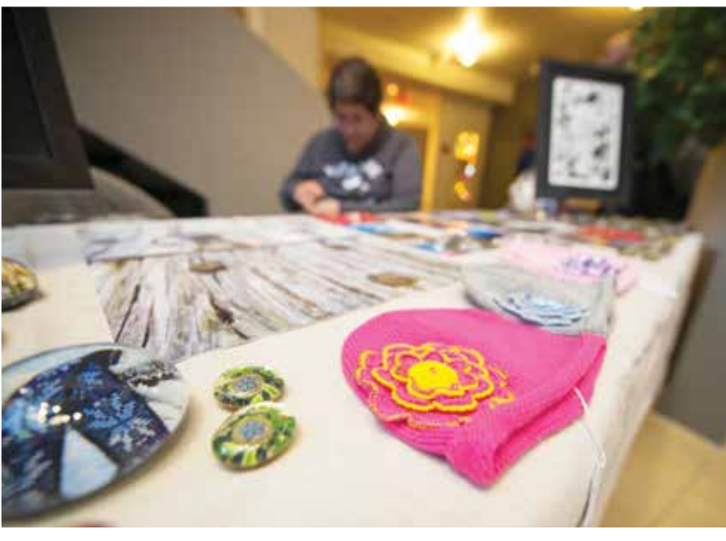
) The first annual CIRI Arts and Crafts Bazaar featured handmade jewelry, ivory carvings and apparel crafted by CIRI shareholders and descendants.