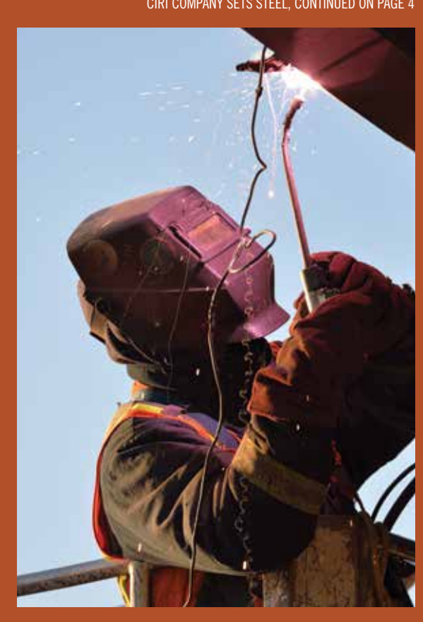
structural supports.

CIRI COMPANY SETS STEEL, CONTINUED ON PAGE 4