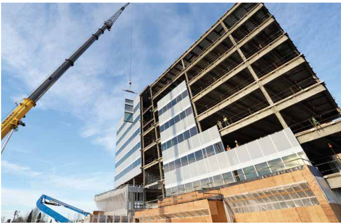
A glass panel is lifted into place on the Fireweed Business Center.