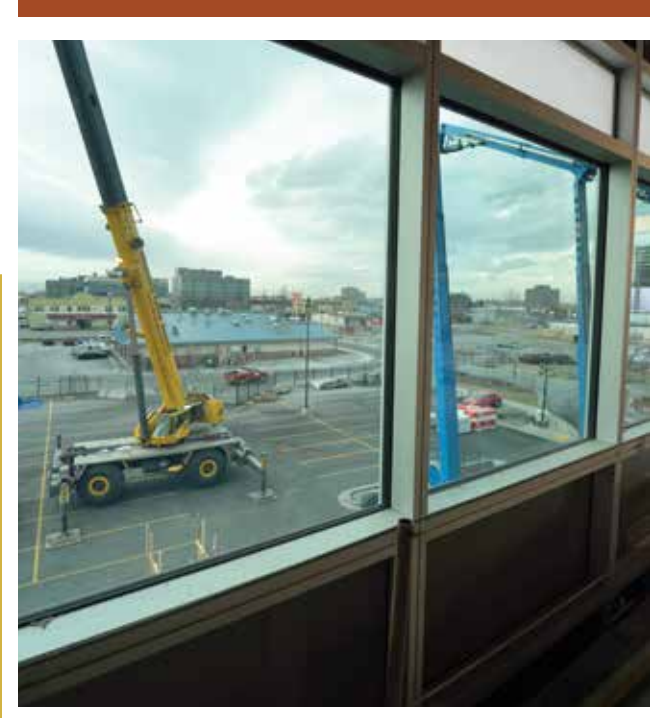
) Looking out the Dynamic Glass panels by View.