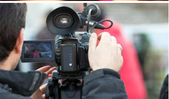
CIRI is expanding its internship program by adding positions with several new departments, including Shareholder Relations, Corporate Communications and Risk Management and Safety.