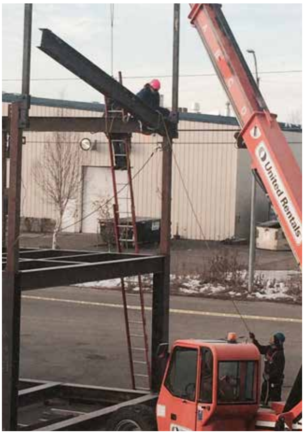
Students in CITC's new ironworkers pre-apprenticeship training program practice their new skills.

CITC plans to offer additional ironworker trainings and hopes to expand its apprenticeship program in 2015.