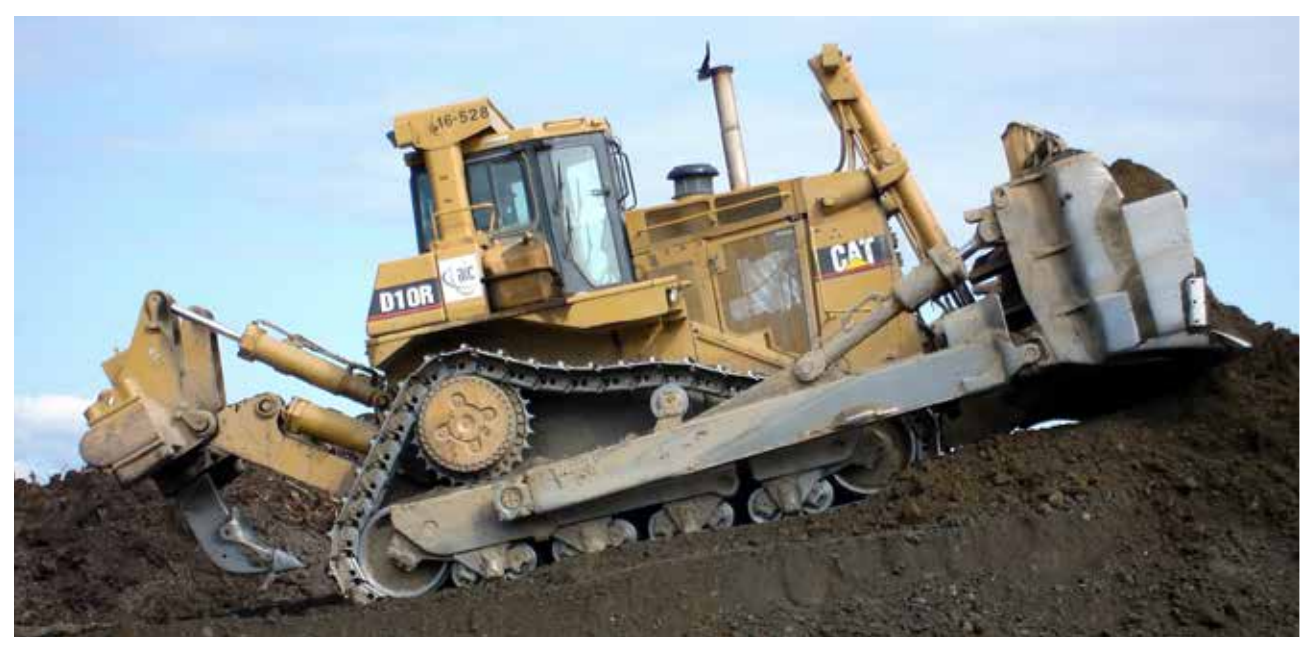
An Alaska Interstate Construction bulldozer working on construction of Anchorage's Tikahtnu Commons in 2007.

In a joint statement to AIC employees, CIRI and Nabors said, "While AIC has had its struggles, we are confident Cruz Construction recognized the talented individuals on the AIC team and is looking forward to positive opportunities for AIC and its employees. (We) wish to thank each of you for your hard work and dedication over the years. Your contributions have been significant, and we have been proud to embrace you as part of our corporate families."